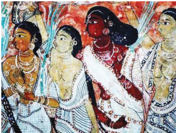
Ladies attending Parvati, Virbhadr Temple, Lepakshi

Paintings of the Nayaka dynasty in the seventeenth and eighteenth centuries are seen in Thiruparakunram,