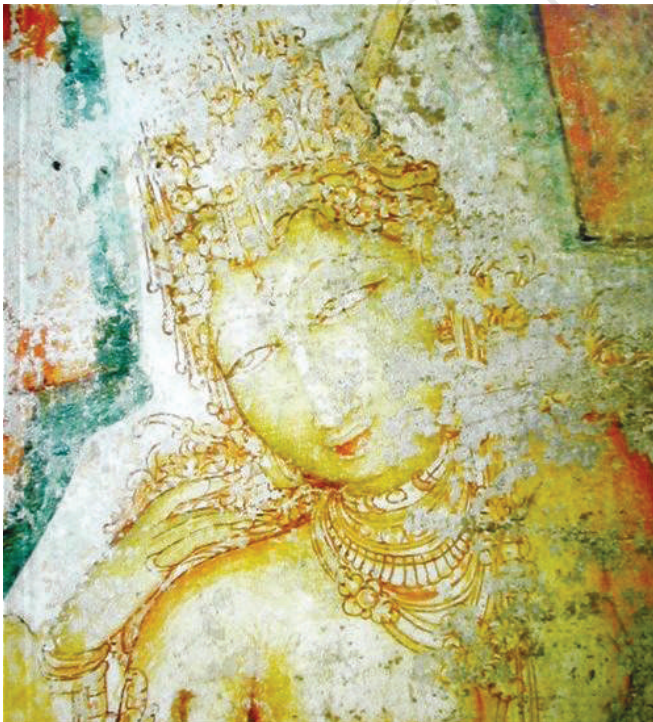
Devi — seventh century CE, Panamalai

On the pillars of the veranda are seen dancing figures of celestial nymphs. The contours of figures are firmly drawn and painted in vermilion red on a lighter background. The body is rendered in yellow with subtle modelling. Supple limbs, expression on the faces of dancers, rhythm in their swaying movement, all speak of the artists' skill in creative imagination in visualising the forms in