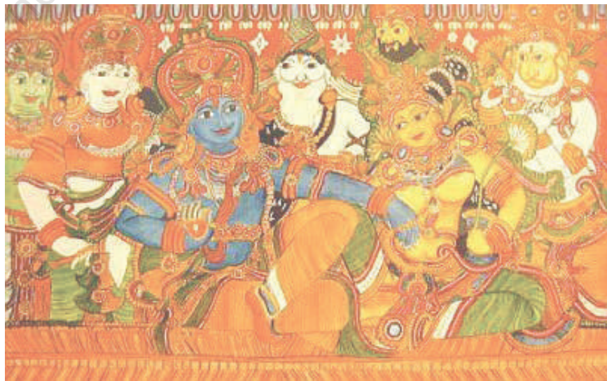
Venugopal, Sri Rama Temple, Tripurayar

Kerala painters (during the period from the sixteenth to the eighteenth century) evolved a pictorial language and technique of their own while discriminately adopting certain stylistic elements from Nayaka and Vijayanagara schools. The painters evolved a language taking cues from contemporary traditions, like Kathakali and kalam ezhuthu