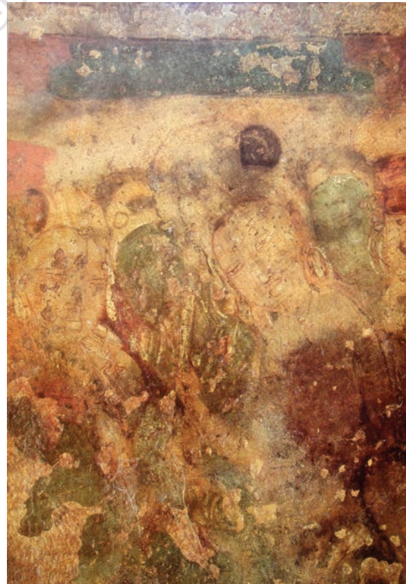
Queen and attendants, Badami

Paintings in this cave depict palace scenes. One shows Kirtivarman, the son of Pulakesi I and the elder brother of Mangalesha, seated inside the palace with his wife and feudatories watching a dance scene. Towards the corner of the panel are figures of Indra and his retinue. Stylistically speaking, the painting represents an