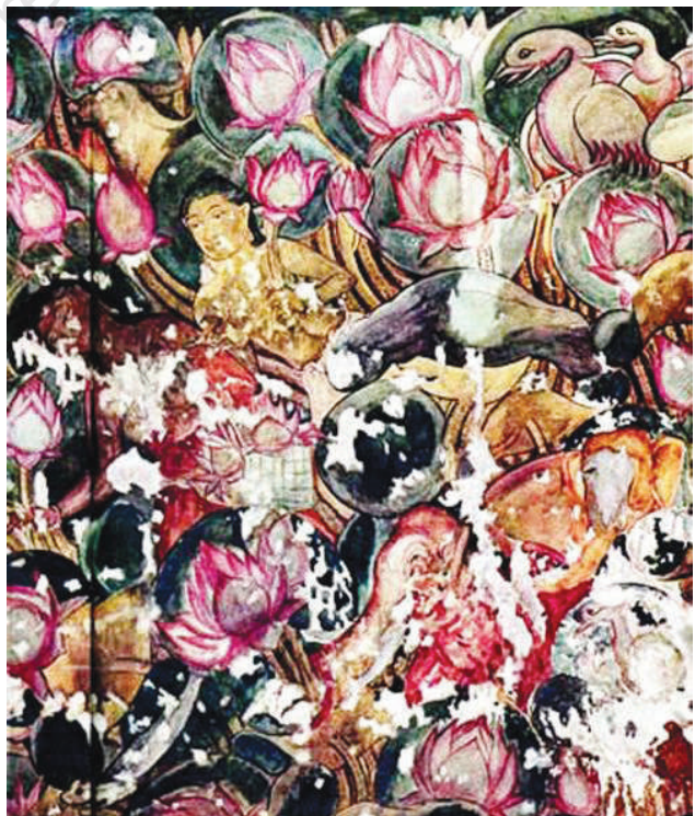
Sittanvasal — early Pandya period, ninth century CE