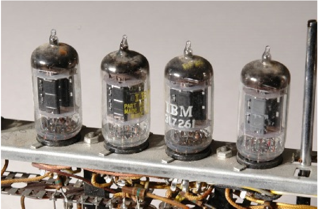
Tubes from a 1950s computer

developed the EDVAC ( E lectronic D iscrete V ariable A utomatic C omputer) which pioneered the "stored program concept". This allowed programs to be read into the computer and so gave birth to the age of general-purpose computers.