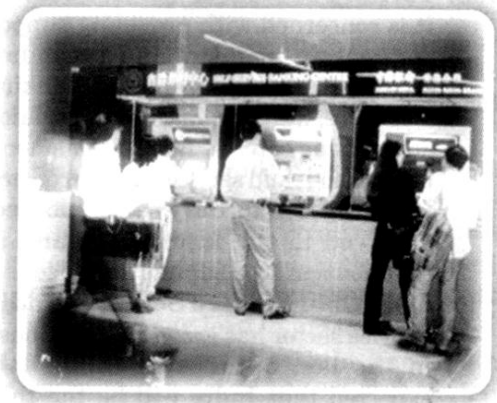
Tertiary Sector (or Service sector)