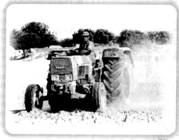
Primary Sector (or Agriculture and related sectors)