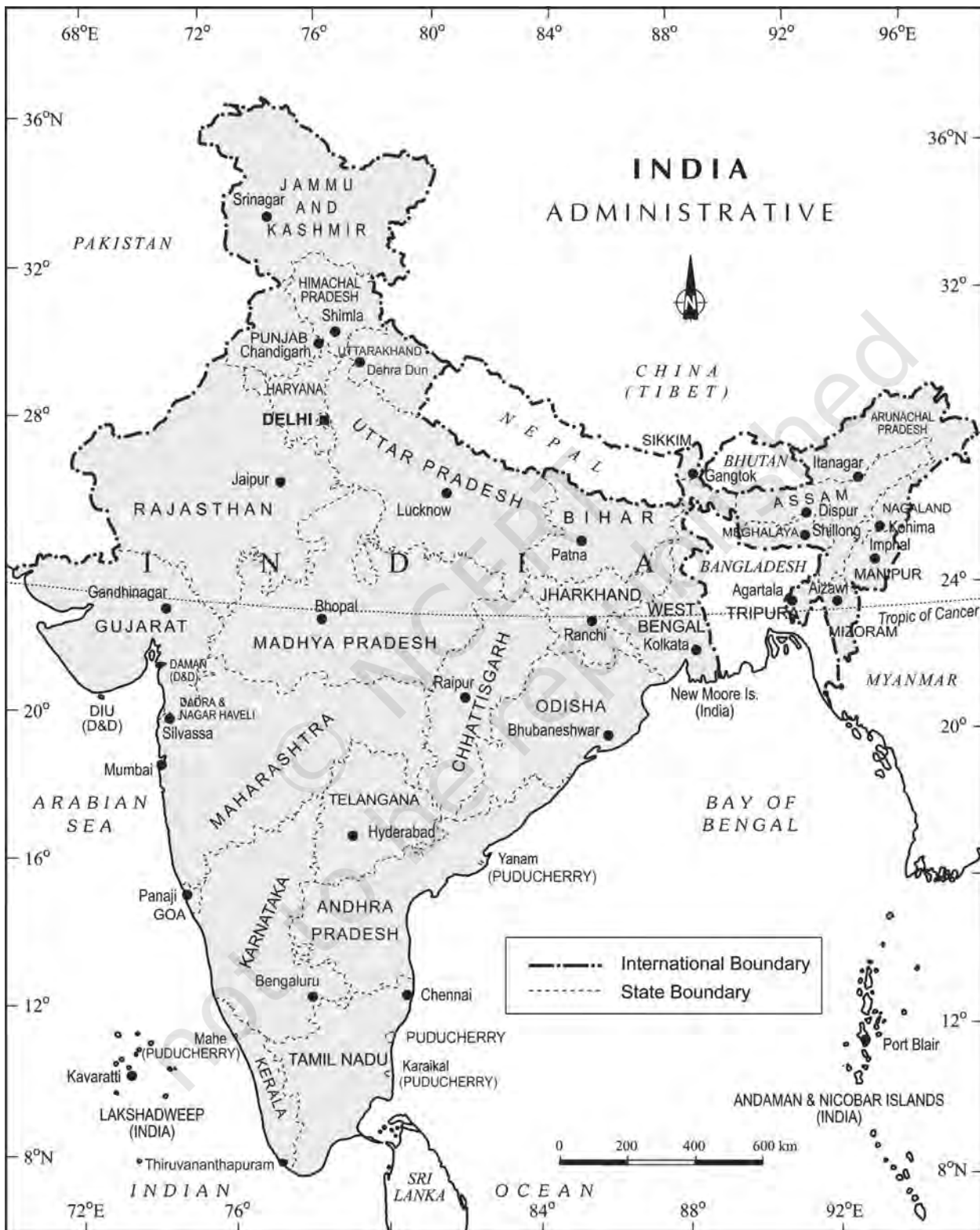
Figure 1.1 : India : Administrative Divisions

Note: Telangana became the 29 th state of India in June 2014.