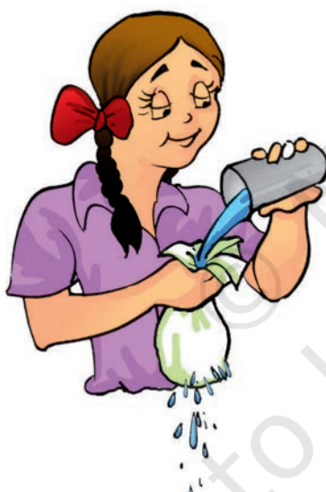
Fig. 4.2 Using a cloth tumbler

Have you ever wondered why a tumbler is not made with a piece of cloth? Recall our experiments with pieces of cloth in Chapter 3 and also keep in mind that we generally use a tumbler to keep a liquid. Therefore, would it not be silly, if we were to make a tumbler out of cloth (Fig 4.2)! What we need for a tumbler is glass, plastics, metal or other such material that will hold water. Similarly, it would not be wise to use paper-like materials for cooking vessels.