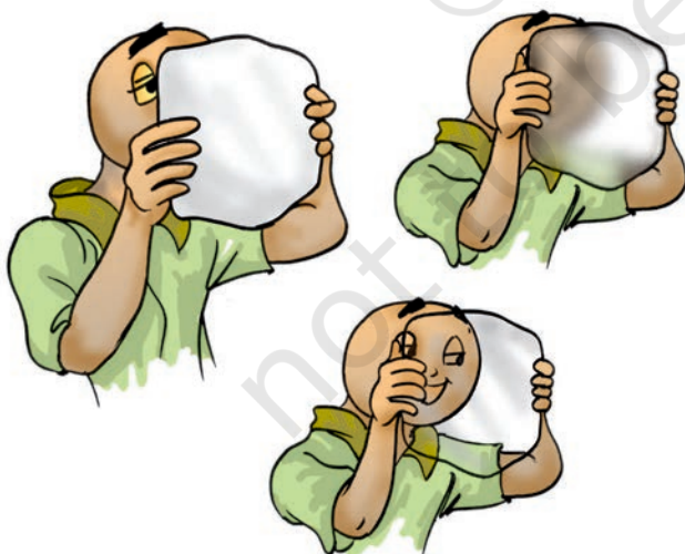
Fig. 4.7 Looking through opaque, transparent or translucent material

You might have played the game of hide and seek. Think of some places where you would like to hide so that you are not seen by others. Why did you choose those places? Would you have tried to