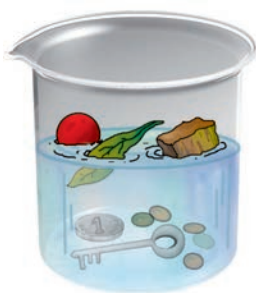
Figure 4.6 Some objects float in water while others sink in it

drops of honey that you let fall into a glass of water. What happens to all of these?