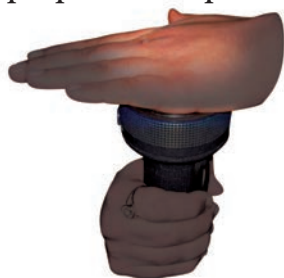
Fig. 4.9 Does torch light pass through your palm?

We can therefore group materials as opaque, transparent and translucent.