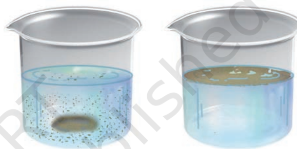
Fig. 4.4 What disappears, what doesn't?

beakers. Fill each one of them about two-thirds with water. Add a small amount (spoonful) of sugar to the first glass, salt to the second and similarly, add small amounts of the other substances into the other glasses. Stir the contents of each of them with a spoon. Wait for a few minutes. Observe what happens to the substances added to water (Fig. 4.4). Note your observations as shown in Table 4.3.