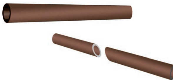
Fig. 4.3 Cutting pieces of materials to see if they have lustre

Do you notice such a shine or lustre in the other materials, cut them anyway as you can? Repeat this in the class with as many materials as possible and make a list of those with and without lustre. Instead of cutting, you can rub the surface of material with sand paper to see if it has lustre.