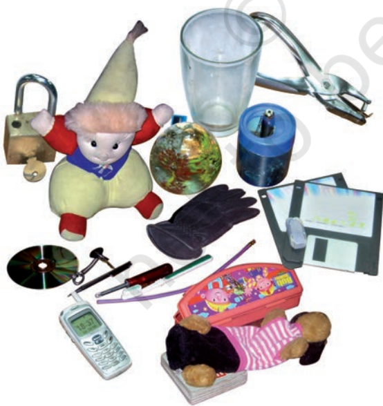
Fig. 4.1 Objects around us

Let us collect as many objects as possible, from around us. Each of us could get some everyday objects from home and we could also collect some objects from the classroom or from outside the school. What will we have in our collection? Chalk, pencil, notebook, rubber, duster, a hammer, nail, soap, spoke of a wheel, bat,