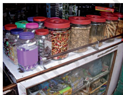
Fig. 4.8 Transparent bottles in a shop

hide behind a glass window? Obviously not, as your friends can see through that and spot you. Can you see through all the materials? Those substances or materials, through which things can be seen, are called transparent (Fig. 4.7). Glass, water, air and some plastics are examples of transparent materials. Shopkeepers usually prefer to keep biscuits, sweets and other eatables in transparent containers of glass or