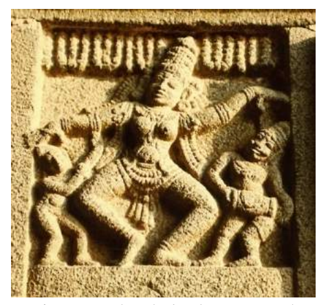
A karana at the Chidambaram temple

After the N\bar{a}tyas\bar{a}stra , another significant available work on dance is Nandikeśvar's Abhinaya Darpaņa (2<sup>nd</sup>century CE). These two manuals present the principles of dance. Indian dance has a grammar. Each dance form is a system of structures at different levels. For instance, the minimal units in a dance are (1) sthāna , standing position; (2) cārī , foot and leg movements; (3) nṛttahasta , hands in a dancing position. A configuration of these constitutes a karaṇa . There are 108 karaṇas ; one can