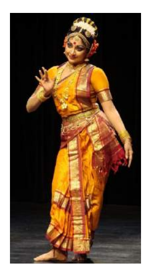
Kucipudī dancer

Kucipudī is non-narrative and abstract dancing. Usually jātiswaram is performed as the nṛtta number. Next is presented a narrative number called śabdam . One of the favourite traditional śabdam numbers is the Daśāvatāra (the ten avatars of Viṣṇu). The śabdam is followed by a nātya number called kalapam . Next in the sequence comes a pure nṛtyabhinay , a number based on literarycum-musical forms like padam , jāvli , ślokam , etc. In such a number each of the sung words is delineated in space through dance i.e.