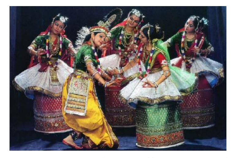
Kṛṣṇa and Rādhā in Rāsalīlā

Maņipurī dance is one of the main styles of Indian classical dances that originated in the beautiful north-eastern state of Manipur. The origin of Maņipurī dance can be traced back to ancient times. It is associated with rituals and traditional festivals; there are legendary references to the dances of Śiva and Pārvatī and other gods and goddesses who created the universe. The dance was performed earlier by maibas and maibīs (priests and priestesses) who re-enact the theme of the creation of the world. With the arrival of Vaiṣṇavism in the 15<sup>th</sup> century, new compositions based on episodes from the life of