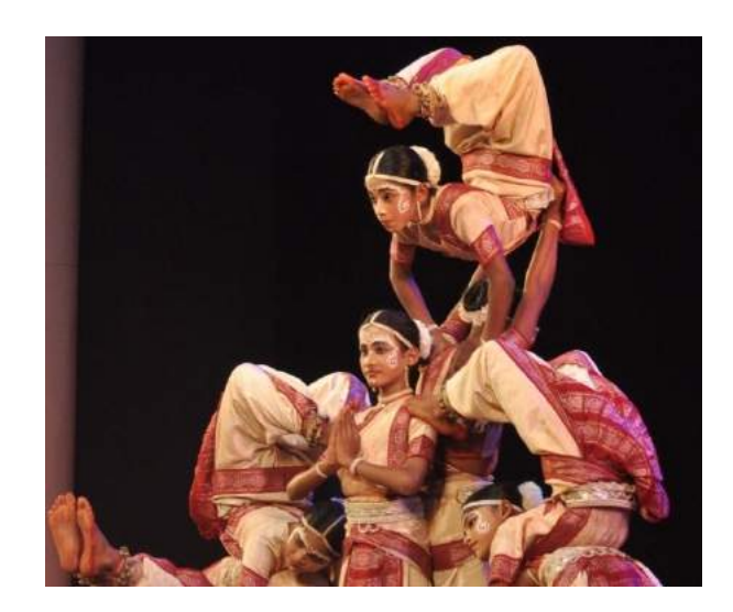
(Top) Gotipua (Left) Oḍissī dancer

Odissī mostly derives its theme from the 12^{th} century Gīta Govinda by Jayadeva. It is generally believed that the composers fixed the tāla and rāga of each song after the model of Gīta Govinda .