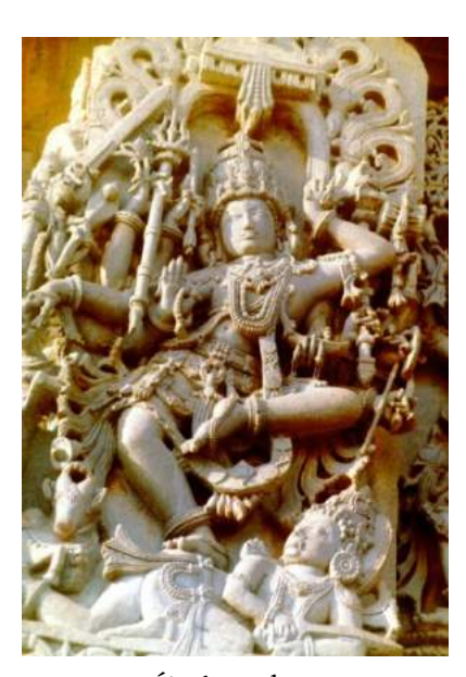
Śiva's tāṇḍava (Belūr temple, Karnataka)

The first still available classical manual on dance is Bharata Muni's N\bar{a}tyas\bar{a}stra (about 2<sup>nd</sup> century BCE). It gives a clear and detailed account of dance. It is said that apsarās (celestial dancers) were made to perform in the earliest drama to make the performance interesting for the audience. After watching the first performance of drama, N\bar{a}tyas\bar{a}stra narrates that Śiva wanted dance and dance movements to be made a part of drama, and for that the sage Taṇḍu was requested to compose and direct a dance. Taṇḍu taught dance movements — c\bar{a}r\bar{s} (foot and leg positions), maṇḍalas (circular movements), karaṇas (movements of hands) and aṅgāhāras (dance postures) — to Bharata Muni who made them part of the