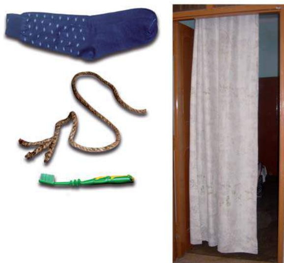
Fig. 3.3: Various articles made from nylon

We use many articles made from nylon, such as socks, ropes, tents, toothbrushes, car seat belts, sleeping bags, curtains, etc. (Fig. 3.3). Nylon is