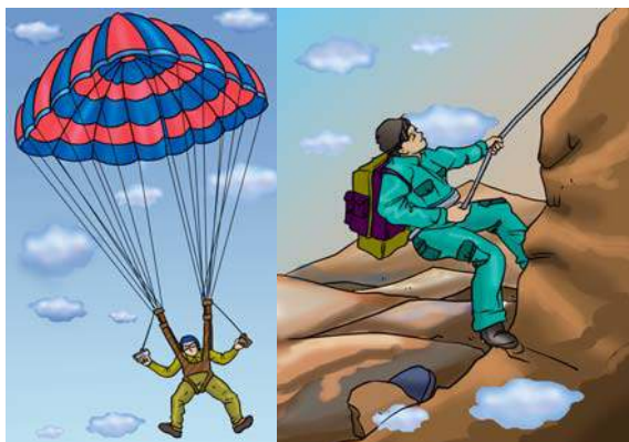
Fig. 3.4: Use of nylon Fibres

also used for making parachutes and ropes for rock climbing (Fig. 3.4). A nylon thread is actually stronger than a steel wire.