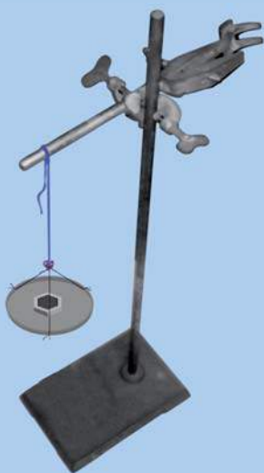
Fig. 3.5: An iron stand with a thread hanging from the clamp

Take an iron stand with a clamp. Take a cotton thread of about 60 cm length. Tie it to the clamp so that it hangs freely from it as shown in Fig. 3.5. At the free end suspend