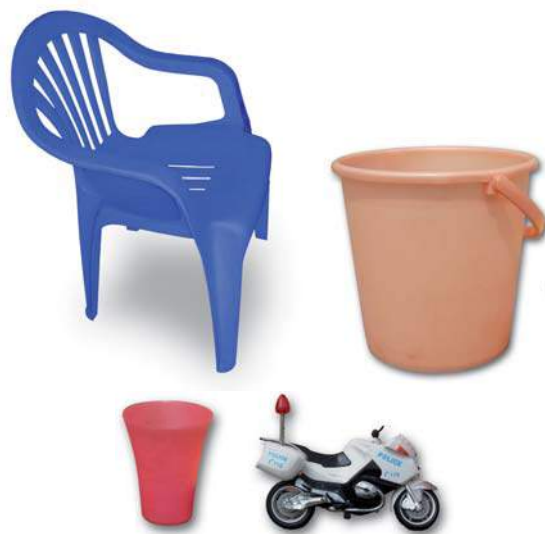
Fig. 3.7 : Various articles made of plastics

Plastic is also a polymer like the synthetic fibre. All plastics do not have the same type of arrangement of units. In some it is linear, whereas in others it is cross-linked. (Fig. 3.6). Plastic articles are available in all possible shapes and sizes as you can see in Fig. 3.7. Have you ever wondered how this is possible? The fact is that plastic is easily mouldable i.e. can be shaped in any form. Plastic can be recycled, reused, coloured, melted, rolled into sheets or made into wires. That is why it finds such a variety of uses.