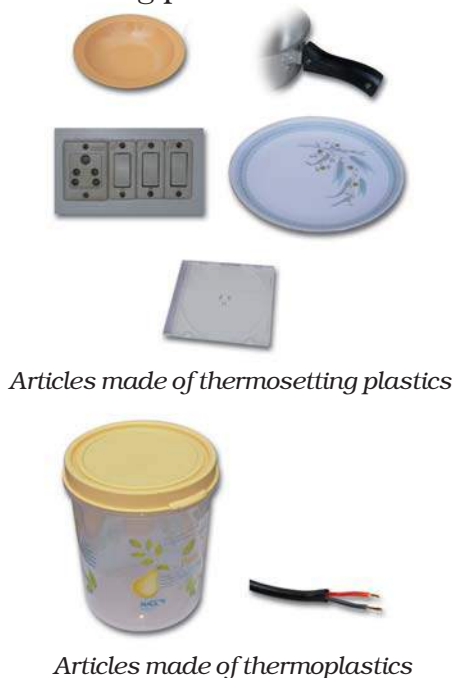
Fig. 3.8 : Some articles made of plastic

On the other hand, there are some plastics which when moulded once, can not be softened by heating. These are called thermosetting plastics . Two examples are bakelite and melamine. Bakelite is a poor conductor of heat and electricity. It is used for making electrical switches, handles of various utensils, etc. Melamine is a versatile material. It resists fire and can tolerate heat better than other plastics. It is used for making floor tiles, kitchenware and fabrics which resist fire. Fig. 3.8 shows the various uses of thermoplastics and thermosetting plastics.