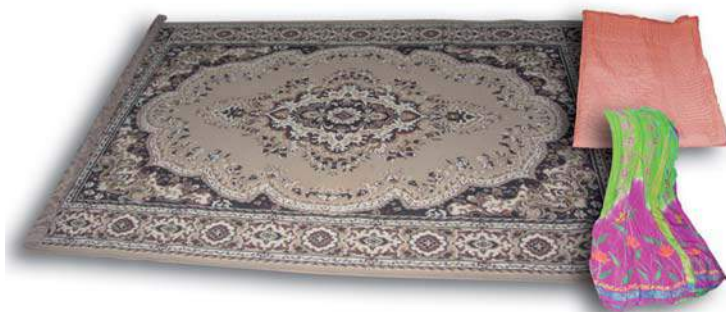
Fig. 3.2 : Articles made of rayon

You have read in Class VII that silk fibre obtained from silkworm was discovered in China and was kept as a closely guarded secret for a long time. Fabric obtained from silk fibre was very costly. But its beautiful texture fascinated everybody. Attempts were made to make silk artificially. Towards the end of the nineteenth century, scientists were successful in obtaining a fibre having properties similar to that of silk. Such a fibre was obtained by chemical treatment of wood pulp. This fibre was called rayon or artificial silk . Although rayon is obtained from a natural source, wood pulp, yet it is a man-made fibre. It is cheaper than silk and can be woven like silk fibres. It can also be dyed in a wide variety of colours. Rayon is mixed with cotton to make bed sheets or mixed with wool to make carpets. (Fig. 3.2.)