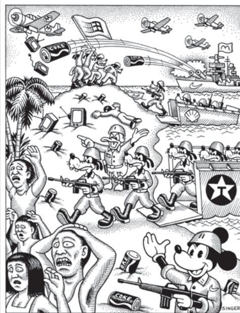
Invading new markets

Make a list of products of multinational companies (MNCs) that are used by you or your family.