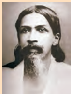
Fig. 9 – Sri Aurobindo Ghose

In a speech delivered on January 15, 1908 in Bombay, Aurobindo Ghose stated that the goal of national education was to awaken the spirit of nationality among the students. This required a contemplation of the heroic deeds of our ancestors. The education should be imparted in the vernacular so as to reach the largest number of people. Aurobindo Ghose emphasised that although the students should remain connected to their own roots, they should also take the fullest advantage of modern scientific discoveries and Western experiments in popular governments. Moreover, the students should also learn some useful crafts so that they could be able to find some moderately remunerative employment after leaving their schools.