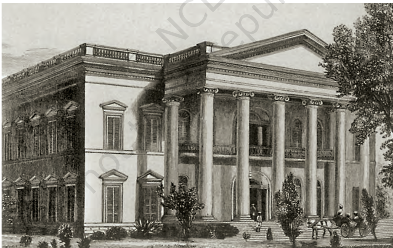
Fig. 7 – Serampore College on the banks of the river Hooghly near Calcutta

Over the nineteenth century, missionary schools were set up all over India. After 1857, however, the British government in India was reluctant to directly support missionary education. There was a feeling that any strong attack on local customs, practices, beliefs and religious ideas might enrage “native” opinion.