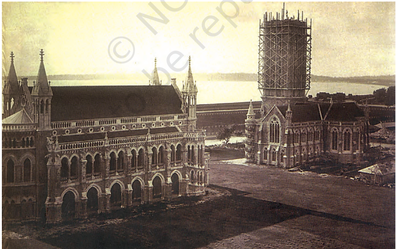
Fig. 5 – Bombay University in the nineteenth century

We must emphatically declare that the education which we desire to see extended in India is that which has for its object the diffusion of the improved arts, services, philosophy, and literature of Europe, in short, European knowledge.