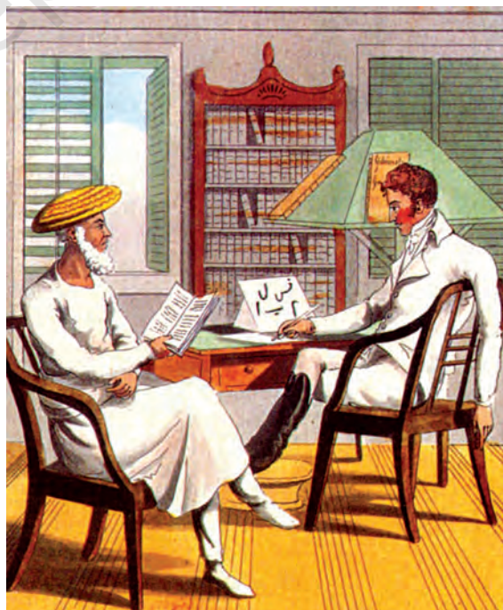
Fig. 1 – William Jones learning Persian

In 1783, a person named William Jones arrived in Calcutta. He had an appointment as a junior judge at the Supreme Court that the Company had set up. In addition to being an expert in law, Jones was a linguist . He had studied Greek and Latin at Oxford, knew French and English, had picked up Arabic from a friend, and had also learnt Persian. At Calcutta, he began spending many hours a day with pandits who taught him the subtleties of Sanskrit language, grammar and