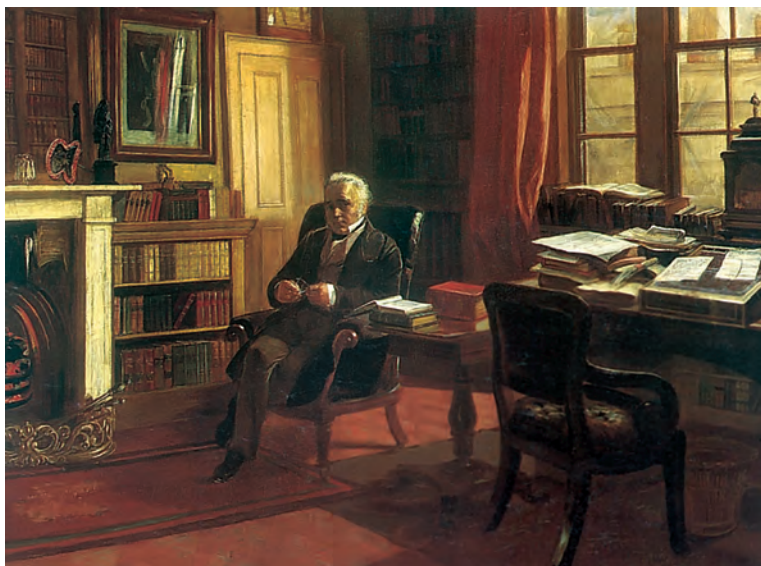
Fig. 4 – Thomas Babington Macaulay in his study