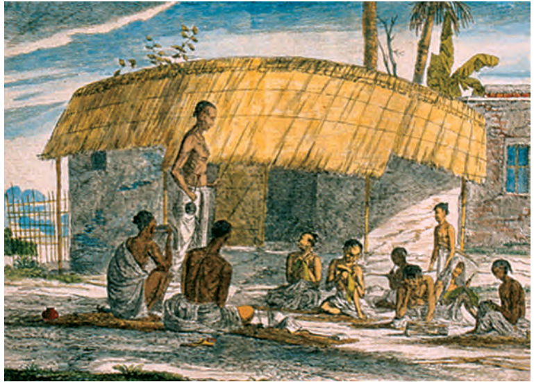
Fig. 8 – A village pathshala This is a painting by a Dutch painter, Francois Solvyn, who came to India in the late eighteenth century. He tried to depict the everyday life of people in his paintings.