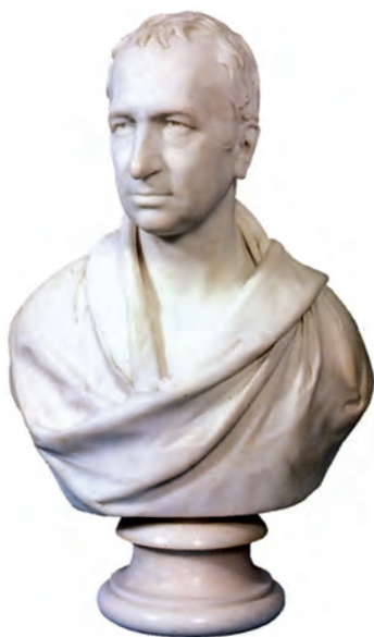
Fig. 2 – Henry Thomas Colebrooke

He was a scholar of Sanskrit and ancient sacred writings of Hinduism.