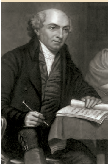
Fig. 6 – William Carey was a Scottish missionary who helped establish the Serampore Mission

The argument for practical education was strongly criticised by the Christian missionaries in India in the nineteenth century. The missionaries felt that education should attempt to improve the moral character of the people, and morality could be improved only through Christian education.