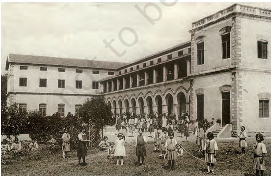
Fig. 12 – Children playing in a missionary school in Coimbatore, early twentieth century

Many individuals and thinkers were thus thinking about the way a national educational system could be fashioned. Some wanted changes within the system set up by the British, and felt that the system could be extended so as to include wider sections of people. Others urged that alternative systems be created so that people were educated into a culture that was truly national. Who was to define what was truly national? The debate about what this “national education” ought to be continued till after independence.