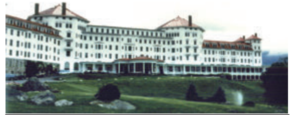
Fig. 26 – Mount Washington Hotel situated in Bretton Woods, US.

The Bretton Woods system inaugurated an era of unprecedented growth of trade and incomes for the Western industrial nations and Japan. World trade grew annually at over 8 per cent between 1950 and 1970 and incomes at nearly 5 per cent. The growth was also mostly stable, without large fluctuations. For much of this period the unemployment rate, for example, averaged less than 5 per cent in most industrial countries.