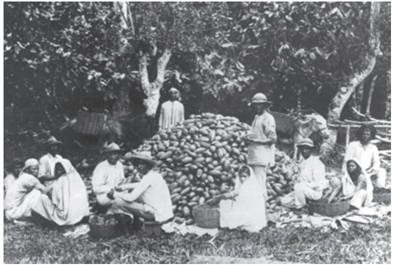
Fig. 14 — Indian indentured labourers in a cocoa plantation in Trinidad, early nineteenth century.

Most indentured workers stayed on after their contracts ended, or returned to their new homes after a short spell in India. Consequently, there are large communities of people of Indian descent in these countries. Have you heard of the Nobel Prize-winning writer