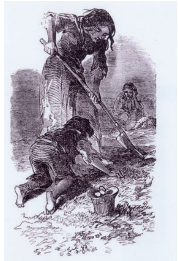
Fig. 4 – The Irish Potato Famine, Illustrated London News, 1849.

The Portuguese and Spanish conquest and colonisation of America was decisively under way by the mid-sixteenth century. European conquest was not just a result of superior firepower. In fact, the most powerful weapon of the Spanish conquerors was not a conventional military weapon at all. It was the germs such as those of smallpox that they carried on their person. Because of their long isolation, America's original inhabitants had no immunity against these diseases that came from Europe. Smallpox in particular proved a deadly killer. Once introduced, it spread deep into the continent, ahead even of any Europeans reaching there. It killed and decimated whole communities, paving the way for conquest.