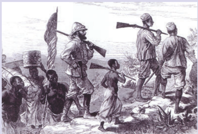
Fig. 11 – Sir Henry Morton Stanley and his retinue in Central Africa, Illustrated London News, 1871.

Stanley was a journalist and explorer sent by the New York Herald to find Livingston, a missionary and explorer who had been in Africa for several years. Like other European and American explorers of the time, Stanley went with arms, mobilised local hunters, warriors and labourers to help him, fought with local tribes, investigated African terrains, and mapped different regions. These explorations helped the conquest of Africa. Geographical explorations were not driven by an innocent search for scientific information. They were directly linked to imperial projects.