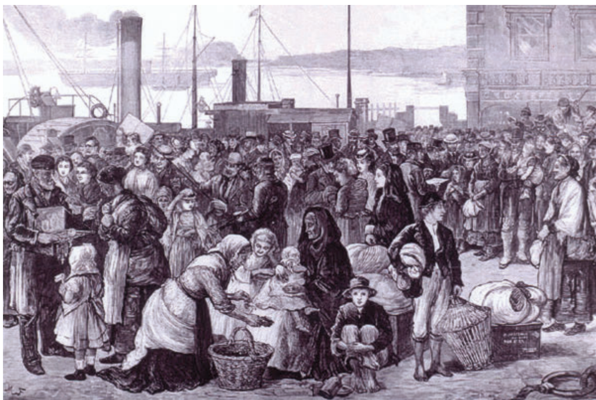
Fig. 7 – Irish emigrants waiting to board the ship, by Michael Fitzgerald, 1874.