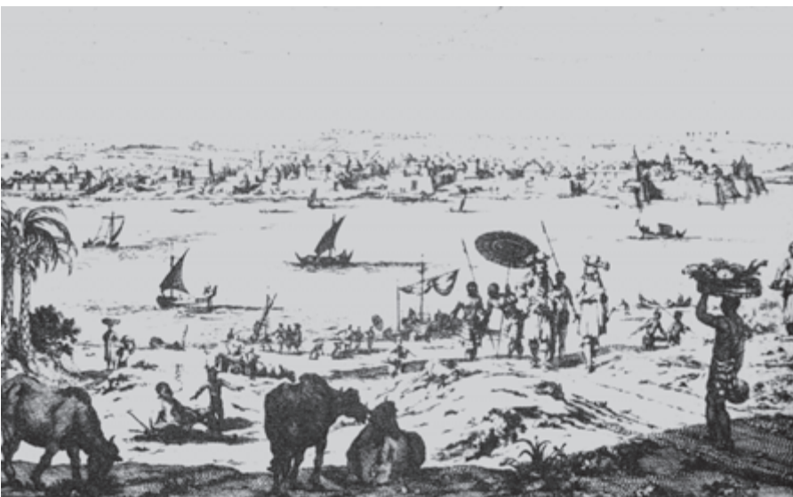
Fig. 18 – A distant view of Surat and its river.

What, then, did India export? The figures again tell a dramatic story. While exports of manufactures declined rapidly, export of raw materials increased equally fast. Between 1812 and 1871, the share of raw cotton exports rose from 5 per cent to 35 per cent. Indigo used for dyeing cloth was another important export for