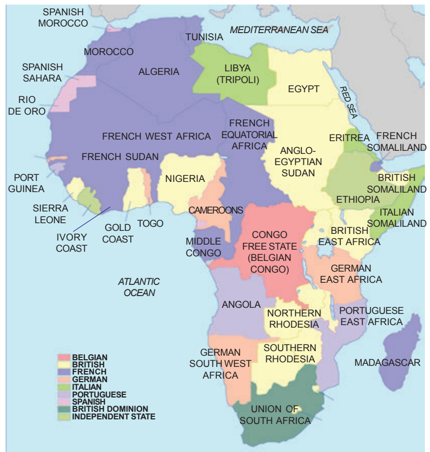
Fig. 10 – Map of colonial Africa at the end of the nineteenth century.

Let us look at one example of the destructive impact of colonialism on the economy and livelihoods of colonised people.