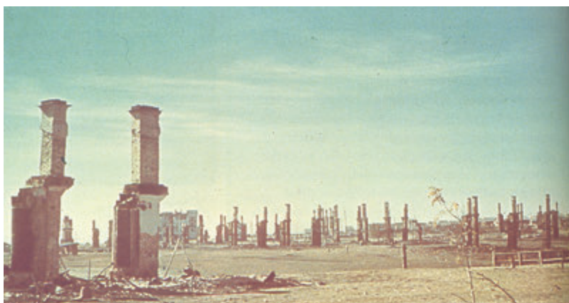
Fig. 25 – Stalingrad in Soviet Russia devastated by the war.