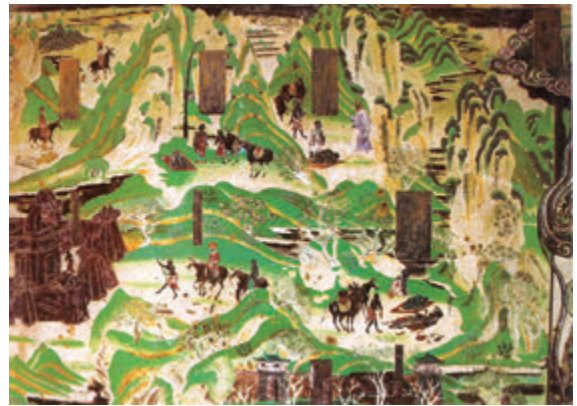
Fig. 2 – Silk route trade as depicted in a Chinese cave painting, eighth century, Cave 217, Mogao Grottoes, Gansu, China.

Many of our common foods such as potatoes, soya, groundnuts, maize, tomatoes, chillies, sweet potatoes, and so on were not known to our ancestors until about five centuries ago. These foods were only introduced in Europe and Asia after Christopher Columbus accidentally discovered the vast continent that would later become known as the Americas.