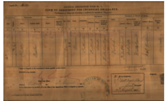
Fig. 16 — A contract form of an indentured labourer.

From the 1900s India's nationalist leaders began opposing the system of indentured labour migration as abusive and cruel. It was abolished in 1921. Yet for a number of decades afterwards, descendants of Indian indentured workers, often thought of as 'coolies', remained an uneasy minority in the Caribbean islands. Some of Naipaul's early novels capture their sense of loss and alienation.