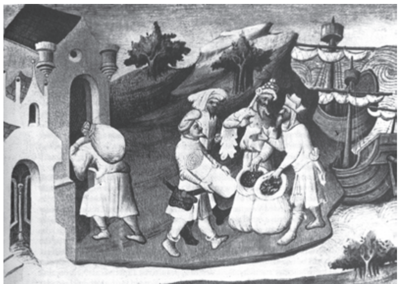
Fig. 3 – Merchants from Venice and the Orient exchanging goods, from Marco Polo, Book of Marvels, fifteenth century.