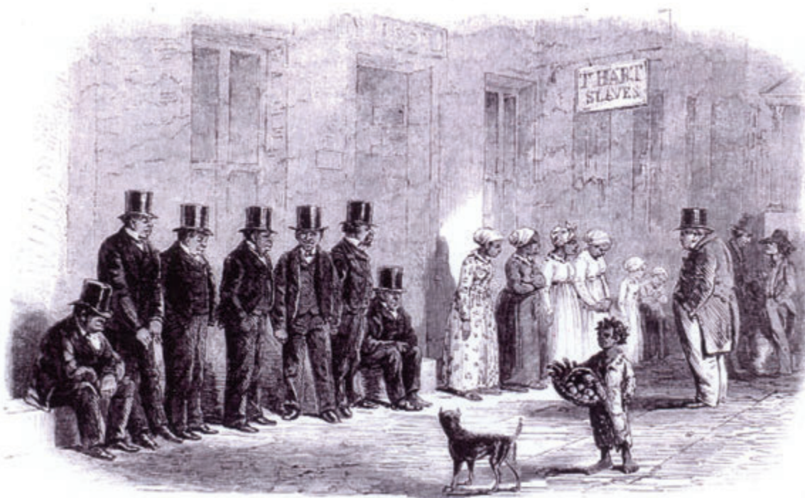
Fig. 5 – Slaves for sale, New Orleans, Illustrated London News, 1851.

Explain what we mean when we say that the world 'shrank' in the 1500s.