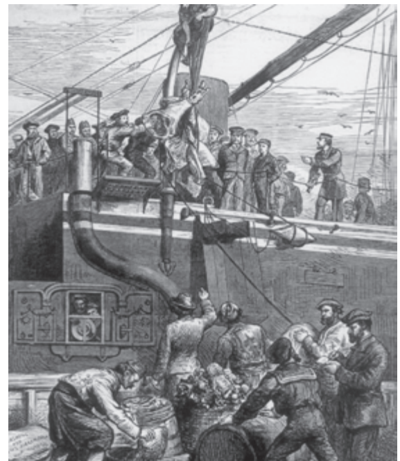
Fig. 9 – Meat being loaded on to the ship, Alexandra, Illustrated London News, 1878. Export of meat was possible only after ships were refrigerated.

Trade flourished and markets expanded in the late nineteenth century. But this was not only a period of expanding trade and increased prosperity. It is important to realise that there was a darker side to this process. In many parts of the world, the expansion of trade and a closer relationship with the world economy also meant a loss of freedoms and livelihoods. Late-nineteenth-century European conquests produced many painful economic, social and ecological changes through which the colonised societies were brought into the world economy.