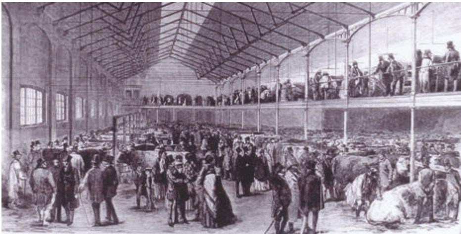
Fig. 8 — The Smithfield Club Cattle Show, Illustrated London News, 1851.

Cattle were traded at fairs, brought by farmers for sale. One of the oldest livestock markets in London was at Smithfield. In the mid-nineteenth century a huge poultry and meat market was established near the railway line connecting Smithfield to all the meat-supplying centres of the country.