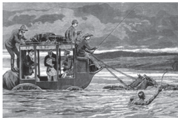
Fig. 12 – Transport to the Transvaal gold mines, The Graphic, 1887.

Employers used many methods to recruit and retain labour. Heavy taxes were imposed which could be paid only by working for wages on plantations and mines. Inheritance laws were changed so that