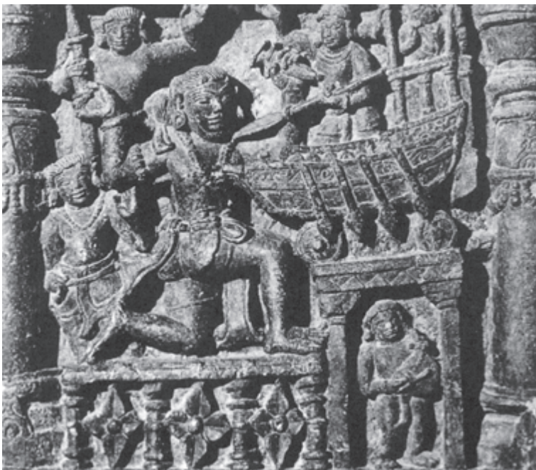
Fig. 1 – Image of a ship on a memorial stone, Goa Museum, tenth century CE.

All through history, human societies have become steadily more interlinked. From ancient times, travellers, traders, priests and pilgrims travelled vast distances for knowledge, opportunity and spiritual fulfilment, or to escape persecution. They carried goods, money, values, skills, ideas, inventions, and even germs and diseases. As early as 3000 BCE an active coastal trade linked the Indus valley civilisations with present-day West Asia. For more than a millennia, cowries (the Hindi cowdi or seashells, used as a form of currency) from the Maldives found their way to China and East Africa. The long-distance spread of disease-carrying germs may be traced as far back as the seventh century. By the thirteenth century it had become an unmistakable link.