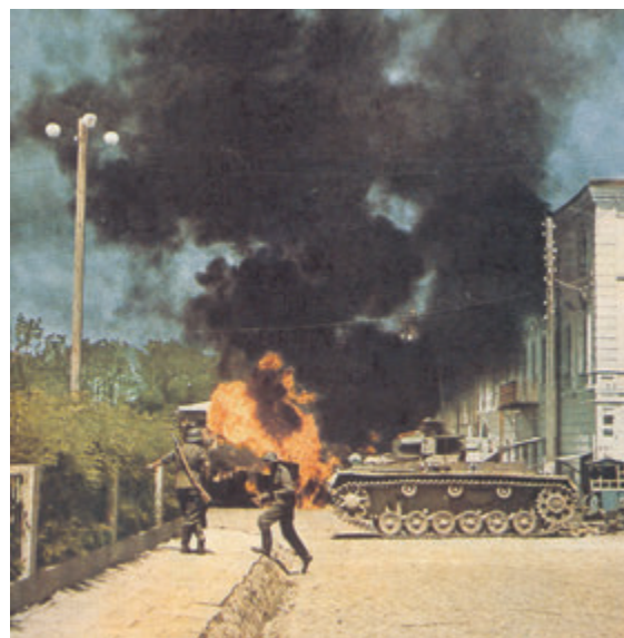
Fig. 24 – German forces attack Russia, July 1941. Hitler's attempt to invade Russia was a turning point in the war.

Two crucial influences shaped post-war reconstruction. The first was the US's emergence as the dominant economic, political and military power in the Western world. The second was the dominance of the Soviet Union. It had made huge sacrifices to defeat Nazi Germany, and transformed itself from a backward agricultural country into a world power during the very years when the capitalist world was trapped in the Great Depression.