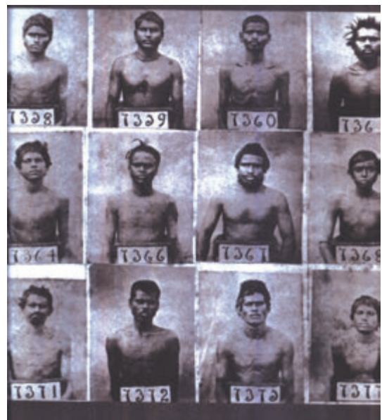
Fig. 15 — Indentured labourers photographed for identification.

Discuss the importance of language and popular traditions in the creation of national identity.