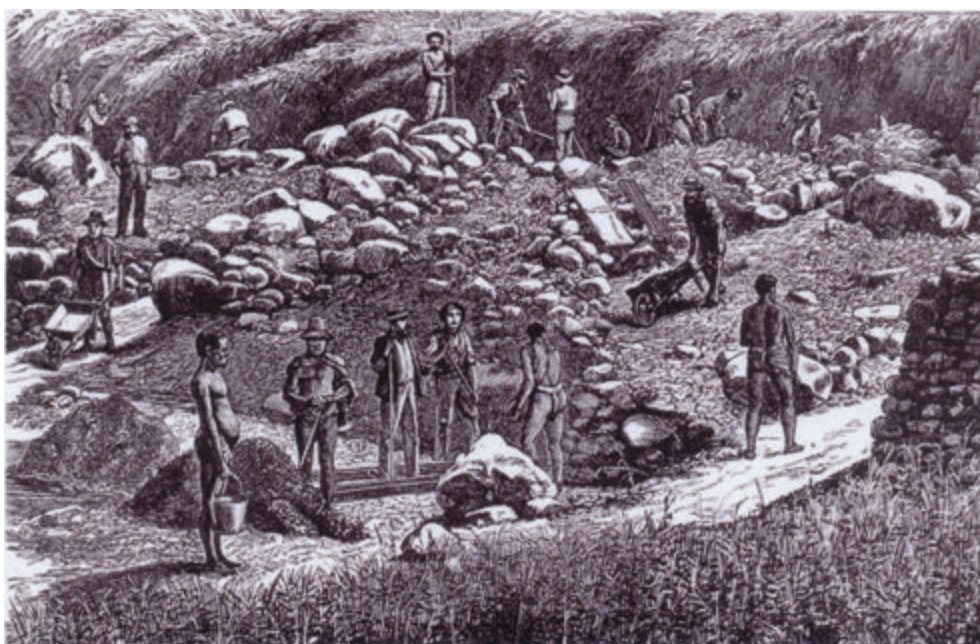
Fig. 13 – Diggers at work in the Transvaal gold fields in South Africa, The Graphic, 1875.

Crossing the Wilge river was the quickest method of transport to the gold fields of Transvaal. After the discovery of gold in Witwatersrand, Europeans rushed to the region despite their fear of disease and death, and the difficulties of the journey. By the 1890s, South Africa contributed over 20 per cent of the world gold production.