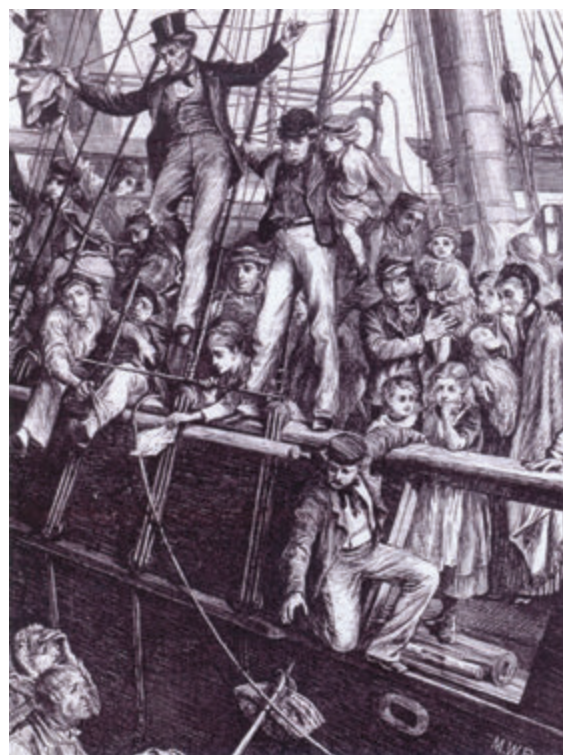
Fig. 6 – Emigrant ship leaving for the US, by M.W. Ridley, 1869.

Nearly 50 million people emigrated from Europe to America and Australia in the nineteenth century. All over the world some 150 million are estimated to have left their homes, crossed oceans and vast distances over land in search of a better future.