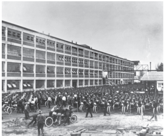
Fig. 21 – T-Model automobiles lined up outside the factory.

Fordist industrial practices soon spread in the US. They were also widely copied in Europe in the 1920s. Mass production lowered costs and prices of engineered goods. Thanks to higher wages, more workers could now afford to purchase durable consumer goods such as cars. Car production in the US rose from 2 million in 1919 to more than 5 million in 1929. Similarly, there was a spurt in the purchase of refrigerators, washing machines, radios, gramophone players, all through a system of 'hire purchase' (i.e., on