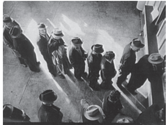
Fig. 23 – People lining up for unemployment benefits, US, photograph by Dorothea Lange, 1938. Courtesy: Library of Congress, Prints and Photographs Division.

In the nineteenth century, as you have seen, colonial India had become an exporter of agricultural goods and importer of manufactures. The depression immediately affected Indian trade. India's exports