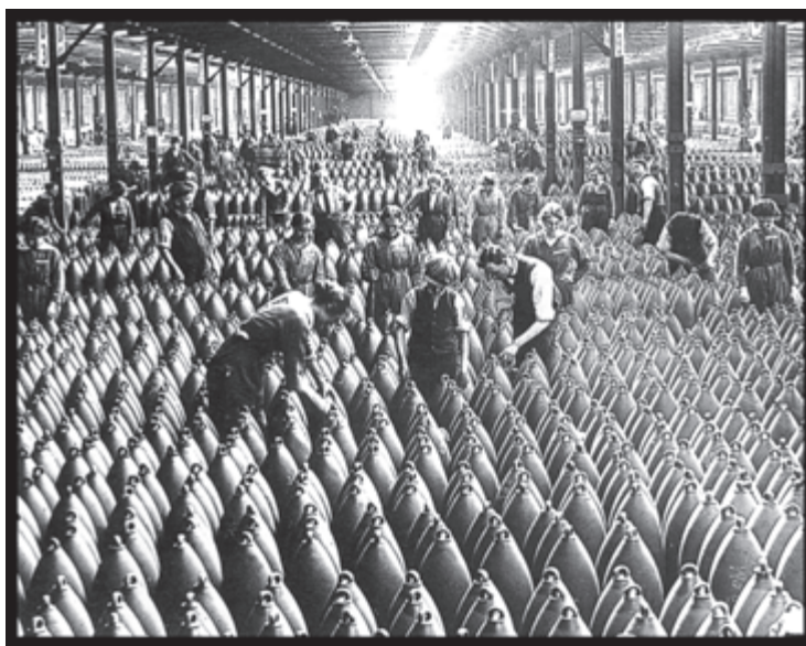
Fig. 20 – Workers in a munition factory during the First World War.

During the war, industries were restructured to produce war-related goods. Entire societies were also reorganised for war – as men went to battle, women stepped in to undertake jobs that earlier only men were expected to do.