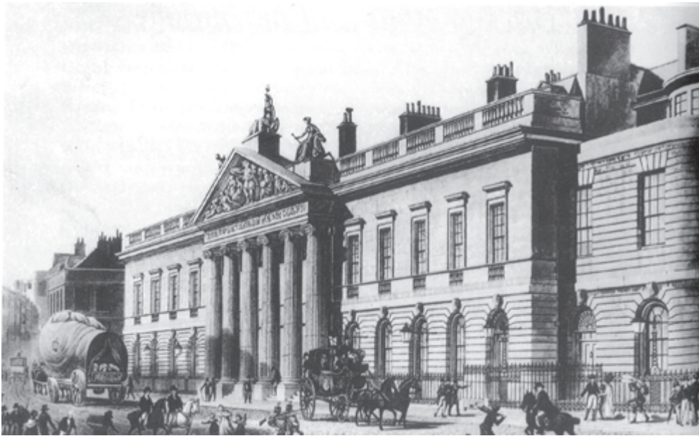
Fig. 17 – East India Company House, London.

This was the nerve centre of the worldwide operations of the East India Company.