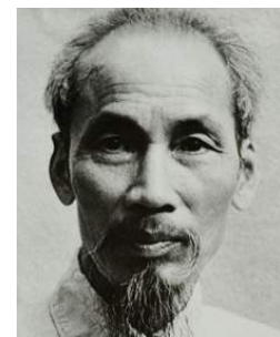
Ho Chi Minh

The mainstream political party in Indo-China was the Vietnam Nationalist Party. Formed in 1927, it was composed of the wealthy and middle class sections of the population. In 1929 the Vietnamese soldiers