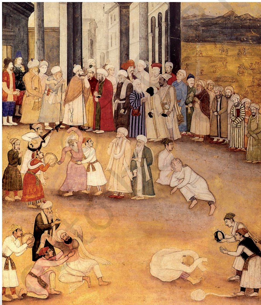
Fig. 4 Mystics in ecstasy.

disregard for the world. Like the saint-poets, the Sufis too composed poems expressing their feelings, and a rich literature in prose, including anecdotes and fables, developed around them. Among the great Sufis of Central Asia were Ghazzali, Rumi and Sadi. Like the Nathpanthis, Siddhas and Yogis, the Sufis too believed that the heart can be trained to look at the world in a different way. They developed elaborate methods of training using zikr (chanting of a name or sacred formula), contemplation, sama (singing), raqs (dancing), discussion of parables, breath control, etc. under the guidance of a master or pir . Thus emerged the silsilas , a spiritual genealogy of Sufi teachers, each following a slightly different method ( tariqa ) of instruction and ritual practice.