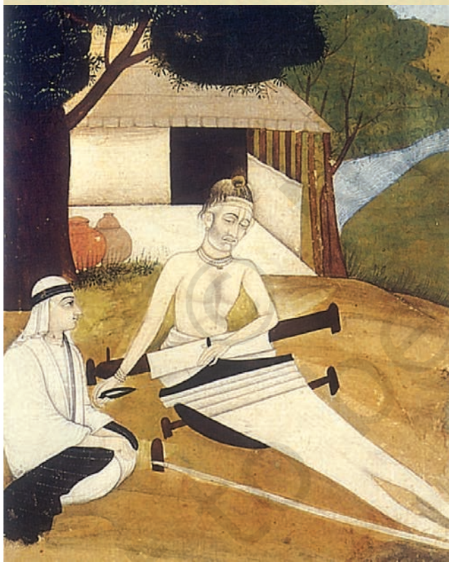
Fig. 9 Kabir working on a loom.

O Allah-Ram present in all living beings Have mercy on your servants, O Lord!