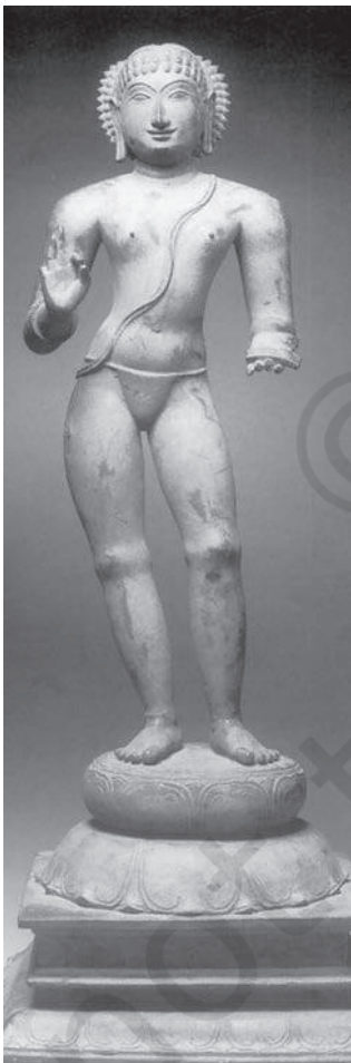
Fig. 2 A bronze image of Manikkavasagar.