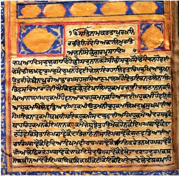
Fig. 11 An early manuscript of the Guru Granth Sahib.

a new script known as Gurmukhi. The three successors of Guru Angad also wrote under the name of “Nanak” and all of their compositions were compiled by Guru Arjan in 1604. To this compilation were added the writings of other figures like Shaikh Farid, Sant Kabir, Bhagat Namdev and Guru Tegh Bahadur. In 1706 this compilation was authenticated by Guru Tegh Bahadur’s son and successor, Guru Gobind Singh. It is now known as Guru Granth Sahib , the holy scripture of the Sikhs.