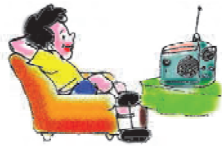
watched the radio