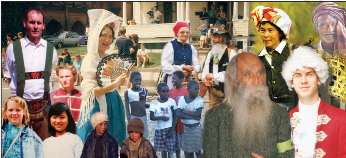
Fig. 8.1: People from various parts of the world

Renuka was excited. Shrikant Uncle was home after a gap of nearly four months. He was a wildlife photographer and travelled widely. Renuka's interest in wildlife and forests began at an early age, when her uncle introduced her to books on nature. Pictures of distant lands and people, who lived there, always fascinated her.