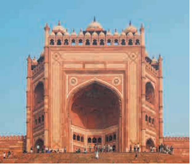
Buland Darwaza, Fatehpur Sikri

The reign of the three emperors, Akbar, Jahangir and Shahjahan was a period of peace, order and prosperity. A new era began in the field of art and architecture. The etched designs on the marble walls of Mosques, tombs and palaces are an evidence of the highly advanced styles of art and architecture. The carved designs on the tombs of Salim Chisti at Fatehpur Sikri and Taj Mahal are its paramount examples. During the period of Akbar and Jahangir the art of ivory carving received royal patronage. The Mughal paintings originated from the Persian styles of painting. There are miniature paintings of Persian style in the manuscript