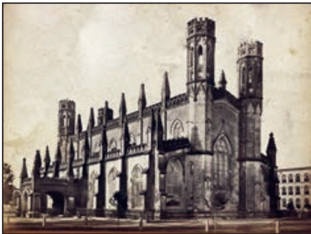
Fort William in Calcutta