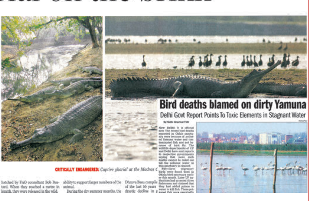
Can you find out the reasons for the above mentioned problems?

(iii) Unclassed Forests: These are other forests and wastelands belonging to both government and private individuals and communities.