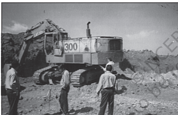
Fig. 12.2 : Noise monitoring at Panchpatmalai Bauxite Mine

The main sources of noise pollution are various factories, mechanised construction and demolition works, automobiles and aircraft, etc. There may be added periodical but polluting noise from sirens, loudspeakers used in various festivals, programmes