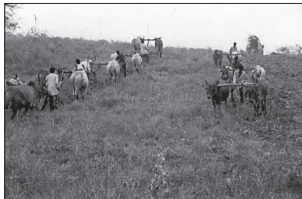
Fig. 12.5 : Community Participation for Land Leveling in Common Property Resources in Jhabua (ASA, 2004)

Source: Evaluation Report, Rajiv Gandhi Mission for Watershed Management, Government of Madhya Pradesh, 2002