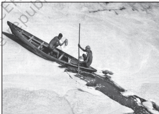
Fig.12.1 : Cutting Through Effluent : Rowing through a pervasive layer of foam on the heavily polluted Yamuna on the outskirts of New Delhi

Indiscriminate use of water by increasing population and industrial expansion has led degradation of the quality of water considerably. Surface water available from rivers, canals, lakes, etc. is never pure. It contains small quantities of suspended particles, organic and inorganic substances. When concentration of these substances increases, the water becomes polluted, and hence becomes unfit for use. In such a situation, the self-purifying capacity of water is unable to purify the water.