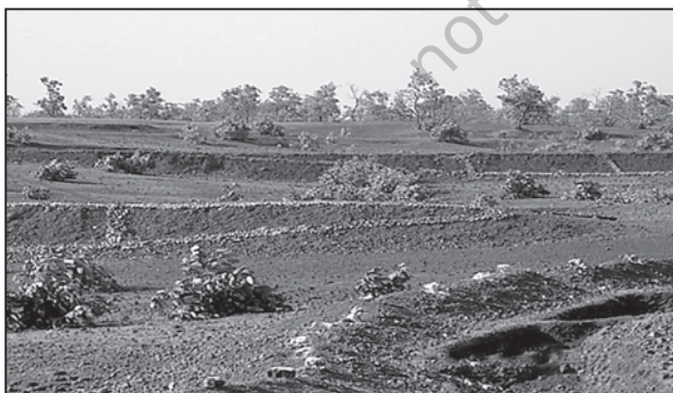
Fig. 12.4 : Trees planted on Common Property Resources in Jhabua

An interesting aspect of this experience is that before the community embarked upon the process of management of the pasture, there was encroachment on this land by a villager from an adjoining village. The villagers called the tehsildar to ascertain the rights of the common land. The ensuing conflict was tackled by the villagers by offering to make the defaulter encroaching on the CPR a member of their user group and sharing the benefits of greening the common lands/pastures. (See the section on CPR in chapter ‘Land Resources and Agriculture’).