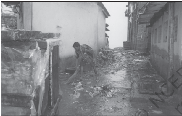
Fig. 12.3 : A view of urban waste in Mahim, Mumbai