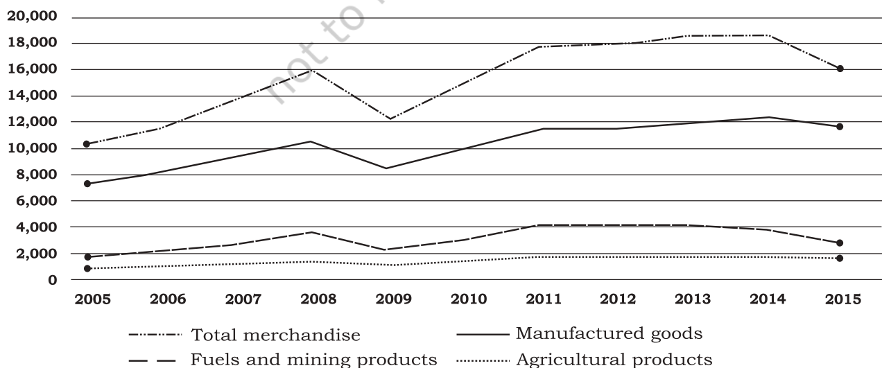
Fig. 9.1 World merchandise exports, 2005-2015

Source: wits.worldbank.org as on 21.07.17