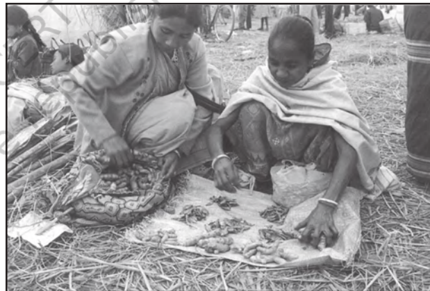
Fig. 9.1: Two women practising barter system in Jon Beel Mela

The initial form of trade in primitive societies was the barter system , where direct exchange of goods took place. In this system if you were a potter and were in need of a plumber, you would have to look for a plumber who would be in need of pots and you could exchange your pots for his plumbing service.