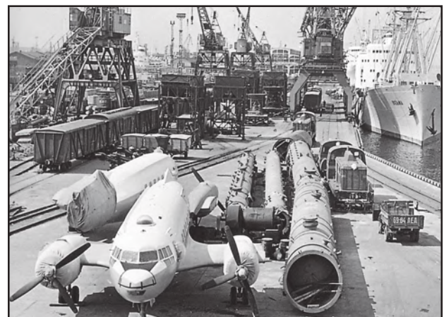
Fig. 9.6: Leningrad Commercial Port