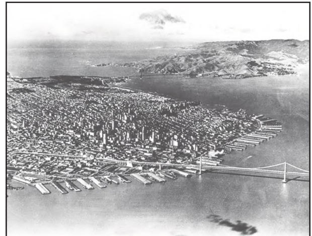
Fig. 9.5: San Francisco, the largest land-locked harbour in the world

The ports provide facilities of docking, loading, unloading and the storage facilities for cargo. In order to provide these facilities, the port authorities make arrangements for maintaining navigable channels, arranging tugs and barges, and providing labour and managerial services. The importance of a port is judged by the size of cargo and the number of ships handled. The quantity of cargo handled by a port is an indicator of the level of development of its hinterland.