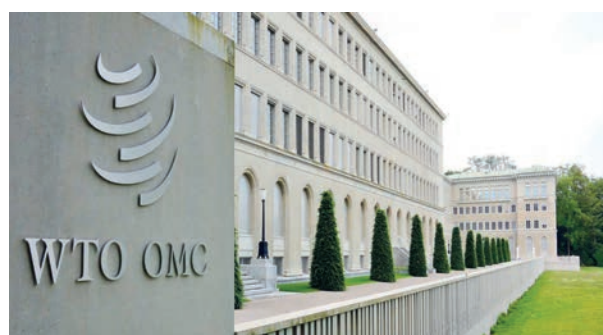
World Trade Organization(WTO)

Members of WTO: Director General, Four Deputy Director General, and other 600 Official Staff from around 80 member countries.