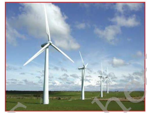
Fig. 1.1: Windmills

The distribution of natural resources depends upon number of physical factors like terrain, climate and altitude. The distribution of resources is unequal because these factors differ so much over the earth.