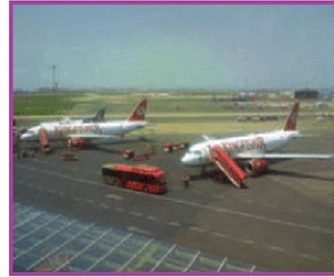
Indira Gandhi International Airport