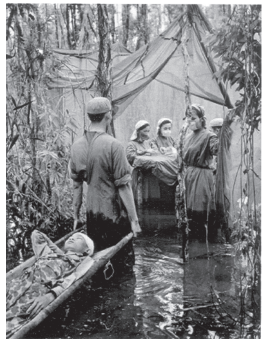
Fig. 19 – Vietnamese women doctors nursing the wounded.