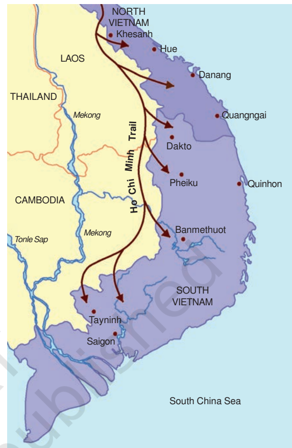
Fig. 14 – The Ho Chi Minh trail. Notice how the trail moved through Laos and Cambodia.

Most of the trail was outside Vietnam in neighbouring Laos and Cambodia with branch lines extending into South Vietnam. The US regularly bombed this trail trying to disrupt supplies, but efforts to destroy this important supply line by intensive bombing failed because they were rebuilt very quickly.