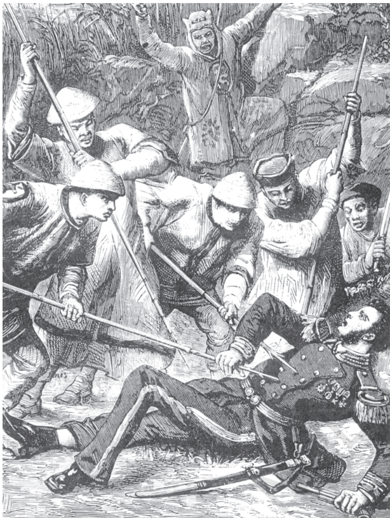
Fig. 3 – Francis Garnier, a French officer who led an attack against the ruling Nguyen dynasty, being killed by soldiers of the court. Garnier was part of the French team that explored the Mekong river. In 1873 he was commissioned by the French to try and establish a French colony in Tonkin in the north. Garnier carried out an attack on Hanoi, the capital of Tonkin, but was killed in the fight.

French troops landed in Vietnam in 1858 and by the mid-1880s they had established a firm grip over the northern region. After the Franco-Chinese war the French assumed control of Tonkin and Annam and, in 1887, French Indo-China was formed. In the following decades the French sought to consolidate their position, and people in Vietnam began reflecting on the nature of the loss that Vietnam was suffering. Nationalist resistance developed out of this reflection.