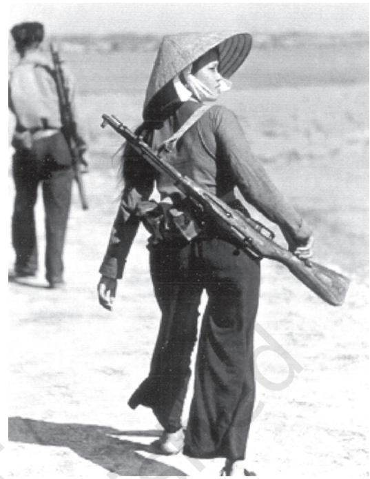
Fig. 18 – With a gun in one hand. Stories about women showed them eager to join the army. A common description was: 'A rosy-cheeked woman, here I am fighting side by side with you men. The prison is my school, the sword is my child, the gun is my husband.'

By the 1970s, as peace talks began to get under way and the end of the war seemed near, women were no longer represented as warriors. Now the image of women as workers begins to predominate. They are shown working in agricultural cooperatives, factories and production units, rather than as fighters.