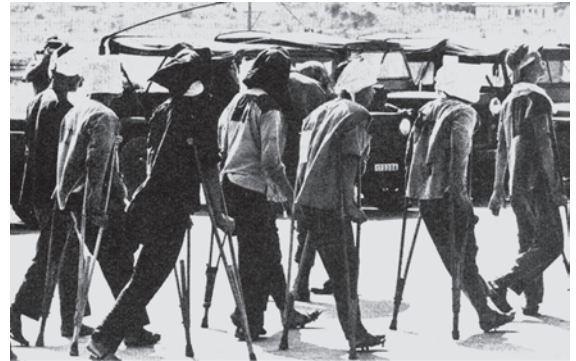
Fig. 20 – North Vietnamese prisoners in South Vietnam being released after the accord .

The widespread questioning of government policy strengthened moves to negotiate an end to the war. A peace settlement was signed in Paris in January 1974. This ended conflict with the US but fighting between the Saigon regime and the NLF continued. The NLF occupied the presidential palace in Saigon on 30 April 1975 and unified Vietnam.