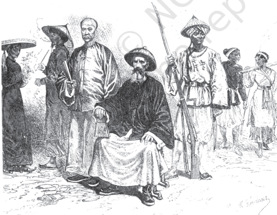
Fig. 5 – A French weapons merchant, Jean Dupuis, in Vietnam in the late nineteenth century.

Indentured labour – A form of labour widely used in the plantations from the mid-nineteenth century. Labourers worked on the basis of contracts that did not specify any rights of labourers but gave immense power to employers. Employers could bring criminal charges against labourers and punish and jail them for non-fulfilment of contracts.