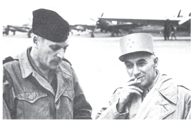
Fig. 10 – The French Commander in Indo-China, General Henri Navarre (right).

With the help of the Ho Chi Minh government in the north, the NLF fought for the unification of the country. The US