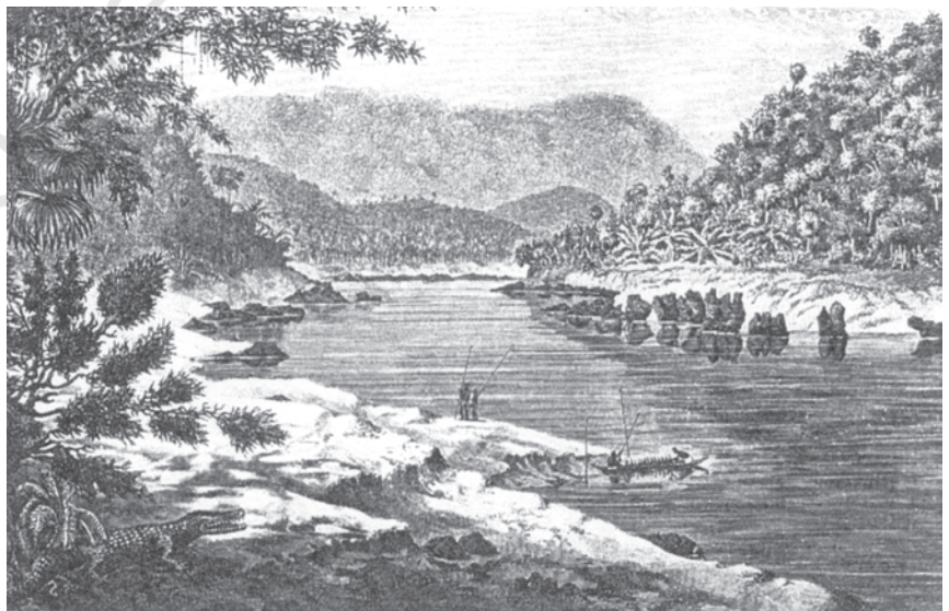
Fig. 4 – The Mekong river, engraving by the French Exploratory Force, in which Garnier participated. Exploring and mapping rivers was part of the colonial enterprise everywhere in the world. Colonisers wanted to know the route of the rivers, their origin, and the terrain they passed through. The rivers could then be properly used for trade and transport. During these explorations innumerable pictures and maps were produced.

French troops landed in Vietnam in 1858 and by the mid-1880s they had established a firm grip over the northern region. After the Franco-Chinese war the French assumed control of Tonkin and Annam and, in 1887, French Indo-China was formed. In the following decades the French sought to consolidate their position, and people in Vietnam began reflecting on the nature of the loss that Vietnam was suffering. Nationalist resistance developed out of this reflection.