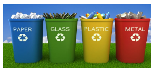
Figure 22.7 Collection of various types of solid wastes in separate bins