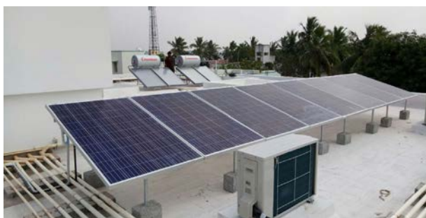
Figure 22.1 Solar Panel

Arrangement of many solar cells side by side connected to each other is called solar panel. The capacity to provide electric current is much increased in the solar panel. But the process of manufacture is very expensive.