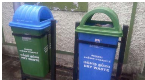
Figure 22.6 Collection of degradable and non-degradable solid wastes