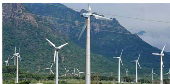
Figure 22.2 Windmill

Windmill is a machine that converts the energy of wind into rotational energy by broad blade attached to the rotating axis. When the blowing air strikes the blades of the windmill, it exerts force and causes the blades to rotate. The rotational movement of the blades operate the generator and the electricity is produced. The energy output from each windmill is coupled together to get electricity on a commercial scale.