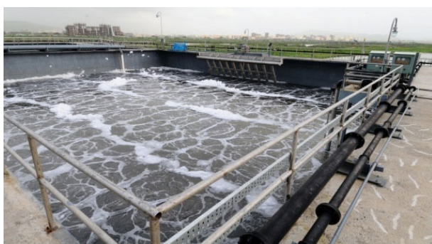
Figure 22.4 A view of sewage treatment plant