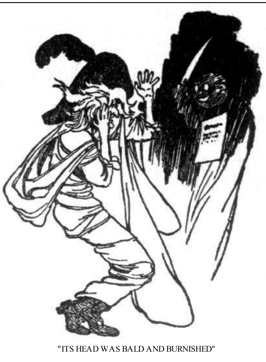
"ITS HEAD WAS BALD AND BURNISHED"

At half-past ten he heard the family going to bed. For some time he was disturbed by wild shrieks of laughter from the twins, who, with the light-hearted gaiety of schoolboys, were evidently amusing themselves before they retired to rest, but at a quarter-past eleven all was still, and, as midnight sounded, he sallied forth. The owl beat against the window-panes, the raven croaked from the old yew-tree, and the wind wandered moaning round the house like a lost soul; but the Otis family