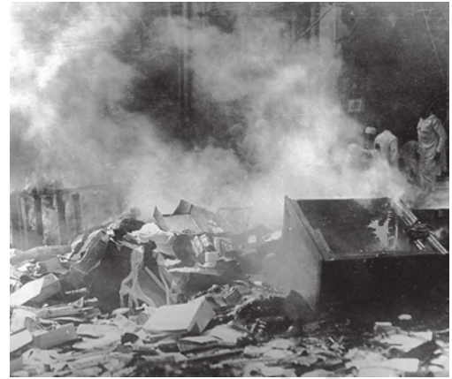
Fig. 14.2 Photographs give us a glimpse of the violence of that time.

also discuss how the history of these experiences can be reconstructed by talking to people and interviewing them, that is, through the use of oral history. At the same time, it will point out the strengths and limitations of oral history. Interviews can tell us about certain aspects of a society's past of which we may know very little or nothing from other types of sources. But they may not reveal very much about many matters whose history we would then need to build from other materials. We will return to this issue towards the end of the chapter.