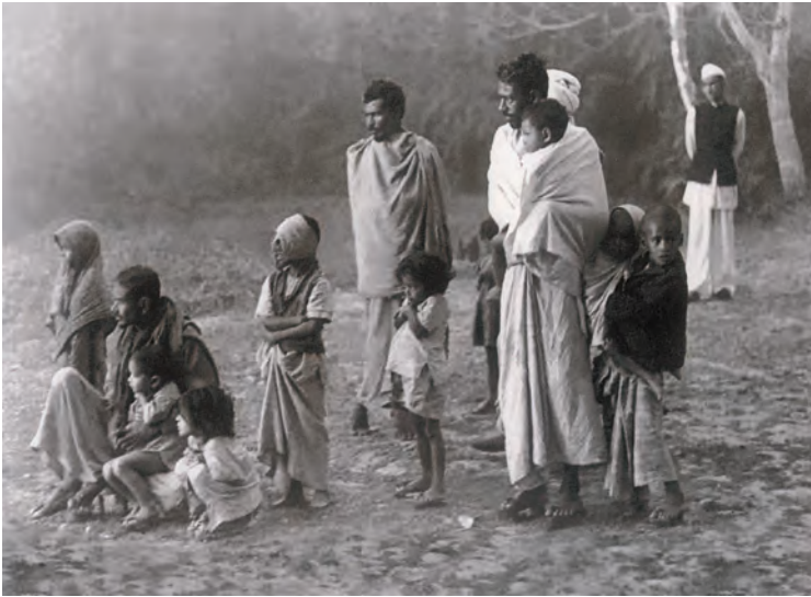
Fig. 14.11 Villagers of a riot-torn village awaiting the arrival of Mahatma Gandhi