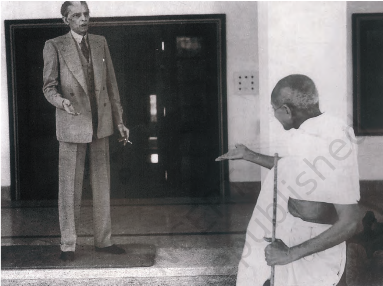
Fig. 14.6 Mahatma Gandhi with Mohammad Ali Jinnah before a meeting with the Viceroy in November 1939

largely Muslims. The British had no intention of annoying the Unionists who still controlled the Punjab government and had been consistently loyal to the British.