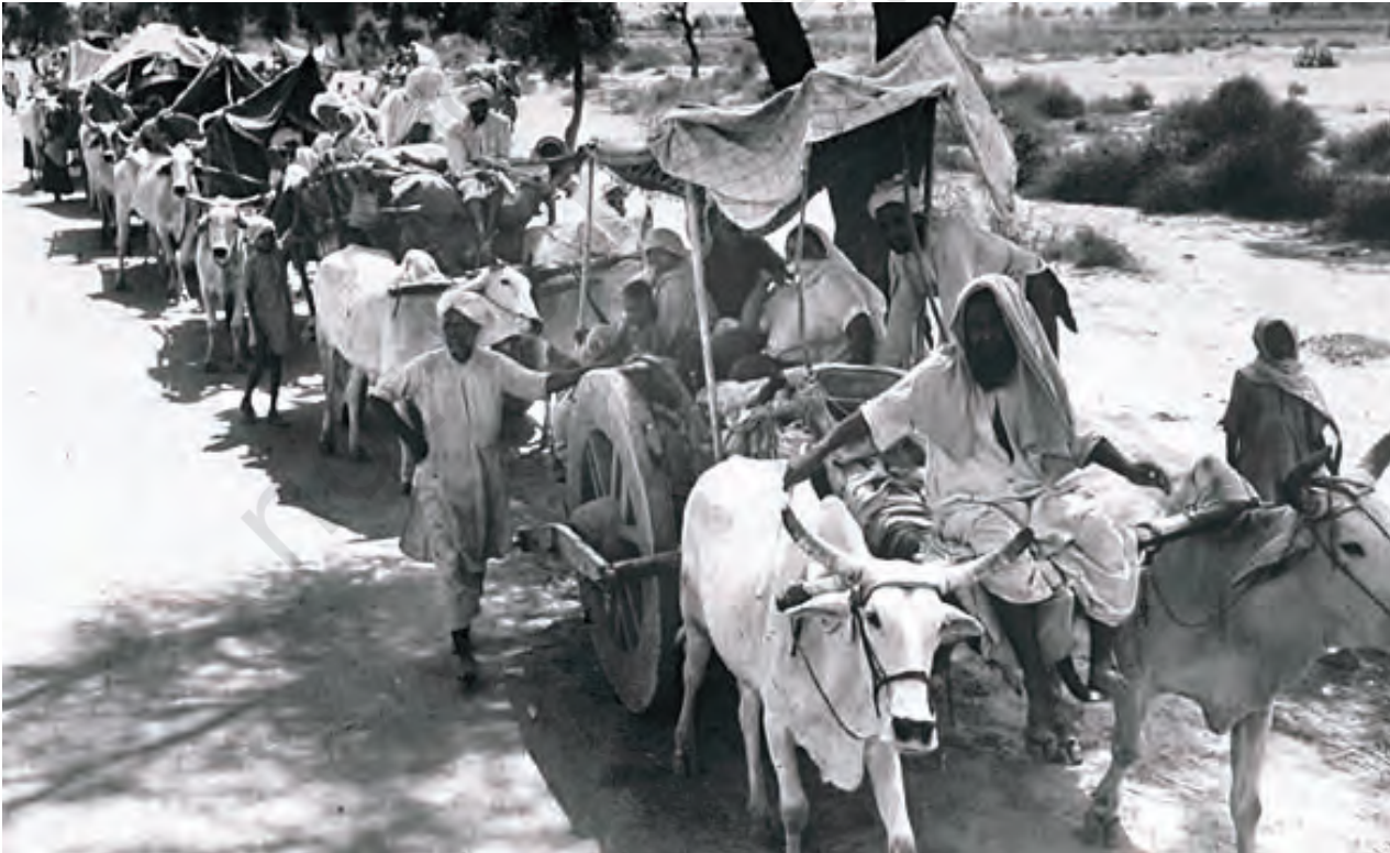
Fig. 14.4 On carts with families and belongings, 1947

The narratives just presented point to the pervasive violence that characterised Partition. Several hundred thousand people were killed and innumerable women raped and abducted. Millions were uprooted, transformed into refugees in alien lands. It is impossible to arrive at any accurate estimate of casualties: informed and scholarly guesses vary from 200,000 to 500,000 people. In all probability, some 15 million had to move across hastily constructed frontiers separating India and Pakistan. As they stumbled across these “shadow lines” – the boundaries between the two new states were not officially known until two days after formal independence – they were rendered homeless, having suddenly lost all their immovable property and most of their movable assets, separated from many of their relatives and friends as well, torn asunder from their moorings, from their houses, fields and fortunes, from their childhood memories. Thus stripped of their local or regional cultures, they were forced to begin picking up their life from scratch.