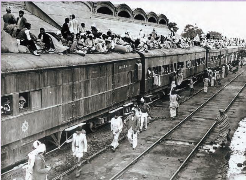
Fig. 14.3 Over 10 million people were uprooted from their homelands and forced to migrate.

"That 'Stop!' sounded like a brute order to me and I instantly thought now I'll be gone. This Sikh will finish me off. But there was no escaping the situation, so I stopped. The burly Sikh came running to me and gave me a mighty hug. Eyes moist, he said, 'For quite a few years now, I have not met a Punjabi Musalman . I have been longing to meet one but you cannot find Punjabi-speaking Musalmans here.'"