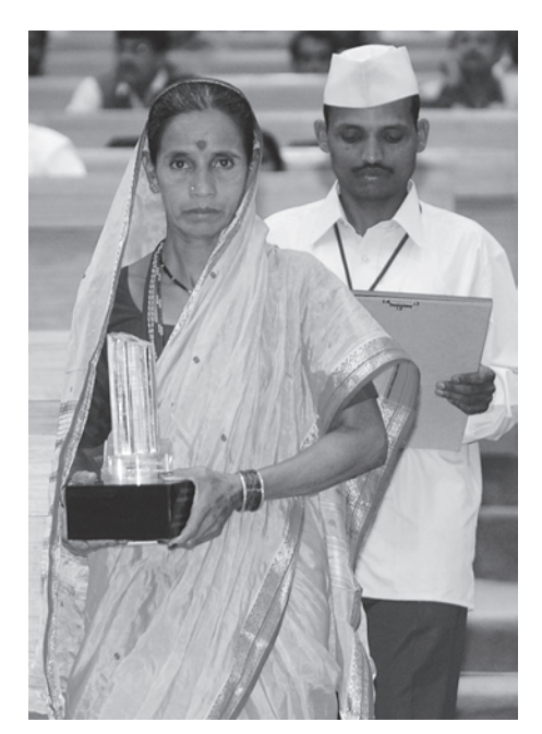
A woman Panch with her reward

importantly, control of local resources is given to the elected local bodies.