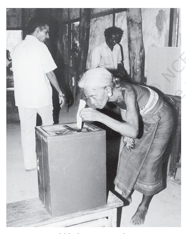
An old lady voting in election

Modern society, with its size and complexity, offers few opportunities for direct democracy. Today, the most common form of democracy, whether for a town of 50,000 or nations of 1 billion, is representative democracy, in which citizens elect officials to make political decisions, formulate laws, and administer programmes for the public good. Ours is a representative democracy. Every citizen has the important right to vote her/his representative. People elect their representatives to all levels from Panchayats, Municipal Boards, State Assemblies