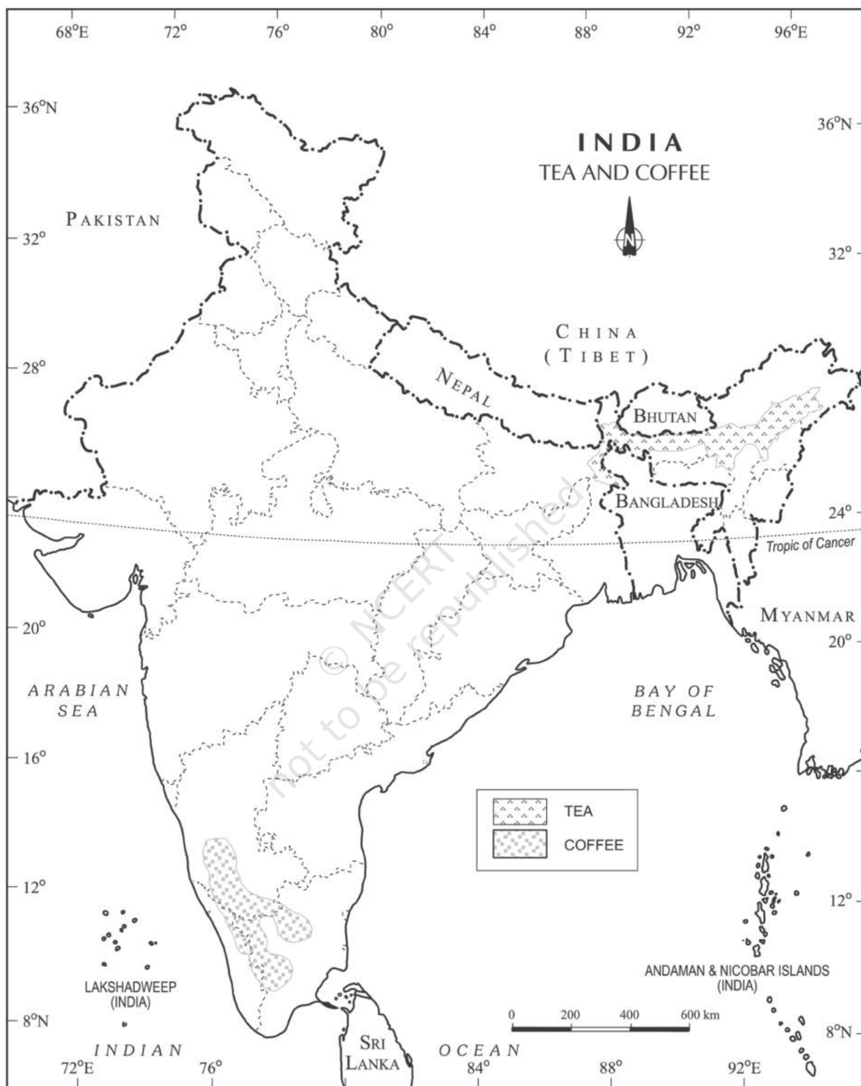
Fig. 5.11 : India – Distribution of Tea and Coffee