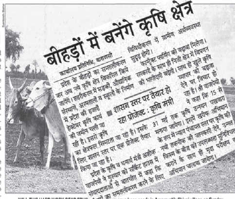
WILL THIS HARD WORK BEAR FRUIT? शिवडी sowing soya bean seeds in Amaravati's Shivni village on Sunday

New Delhi: While BT cotton's prohibitively exorbitant costs were a key reason behind farmers' distress in Vidarbha, the Centre is waking up to an inverse scenario. In the past, post-SC intervention in the Monsanto case, where low prices of BT cotton may cause crop failure. The fears stem from the apex court's refusal to stay the MTPC directive to Monsanto which will bring down seed prices. BT cotton, expensive for small farmers, is not suitable for rain-fed areas like Vidarbha but only suitable for irrigated regions. With the Planning Com- appropriately priced, should be made available to support farmers from falling in the cotton trap. Probing crop failures, the PM's panel found that farmers were not advised on crop rotation. The sold seeds across Vidarbha were in packets bearing in small letters "best used when irrigated areas". The villagers complained they had not noticed the manufacturer's warning too late as it was "in very small letters". Indebtedness being at the heart of the rural distress, the issue of credit too has come up for fresh research. The Centre has been advised to provide loans on low inter-