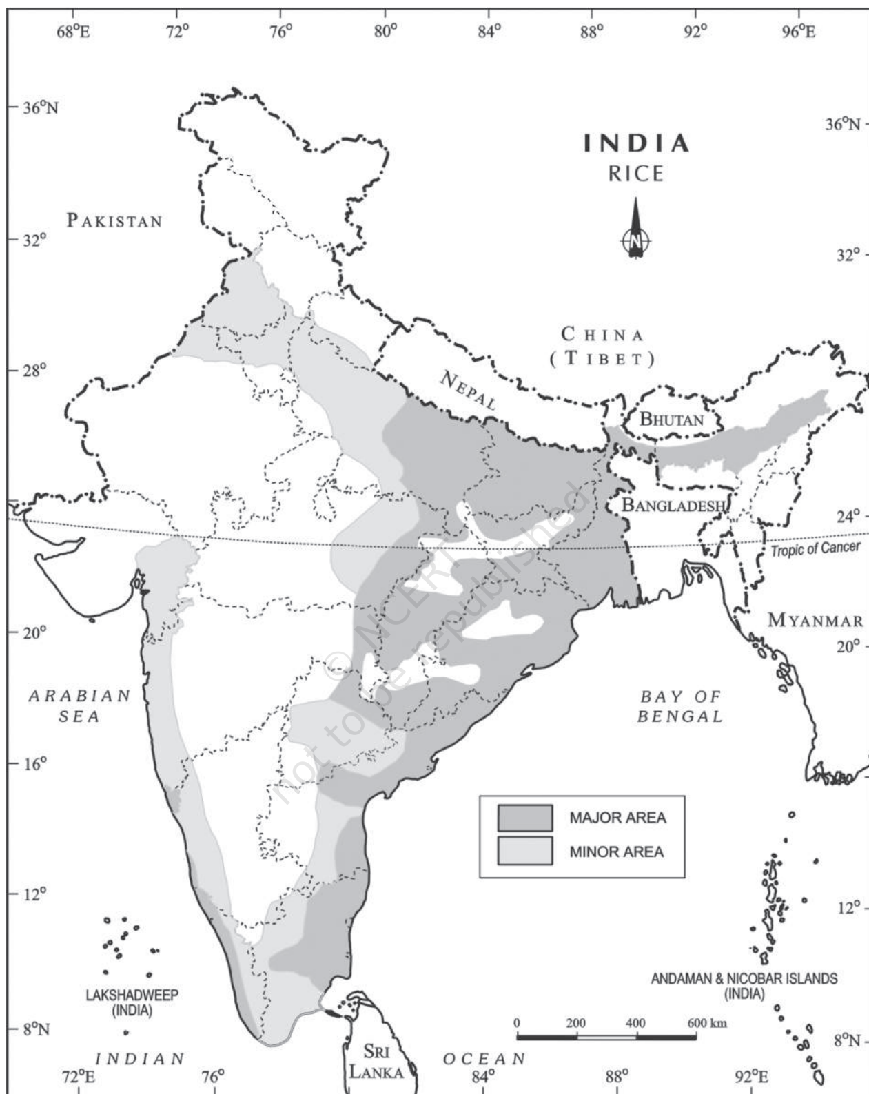
Fig. 5.3 : India - Distribution of Rice