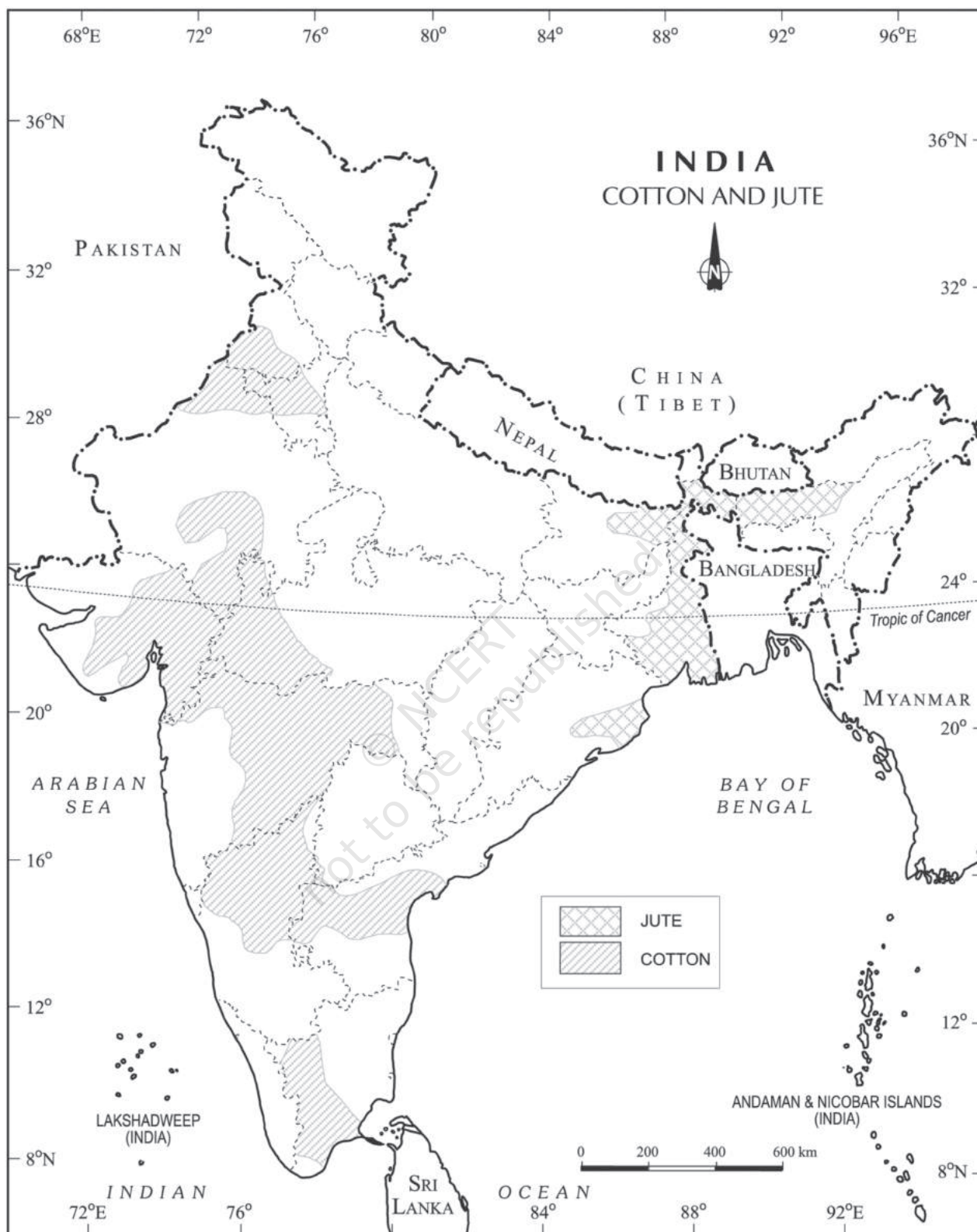
Fig. 5.6 : India – Distribution of Cotton and Jute