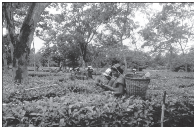
Fig. 5.10 : Tea Farming

Tea is a plantation crop used as beverage. Black tea leaves are fermented whereas green tea leaves are unfermented. Tea leaves have rich content of caffeine and tannin. It is an indigenous crop of hills in northern China. It is grown over undulating topography of hilly areas and well-drained soils in humid and sub-humid tropics and sub-tropics. In India, tea plantation started in 1840s in Brahmaputra valley of Assam which still is a major tea growing area in the country. Later on, its plantation was introduced in the sub-Himalayan region of West Bengal (Darjeeling, Jalpaiguri and Cooch Behar districts). Tea is also cultivated on the lower slopes of Nilgiri and