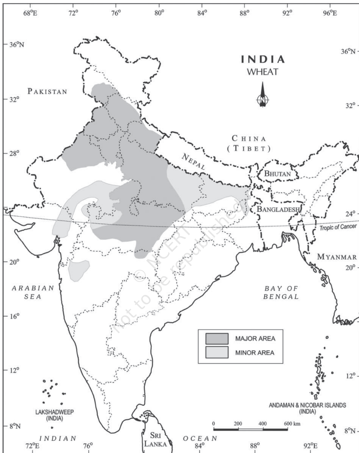
Fig. 5.4 : India - Distribution of Wheat