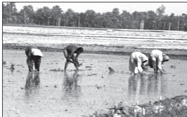
Fig. 5.2 : Rice transplantation in southern parts of India

India contributes 21.9 per cent of rice production in the world and ranked second after China in 2017. About one-fourth of the total cropped area in the country is under rice cultivation. West Bengal, Uttar Pradesh, and Punjab are the leading rice producing states in the country. The yield level of rice is high in Punjab, Tamil Nadu, Haryana, Andhra Pradesh, Telangana, West Bengal and Kerala. In the first four of these states almost the entire land under rice cultivation is irrigated. Punjab and Haryana are not traditional rice growing areas. Rice