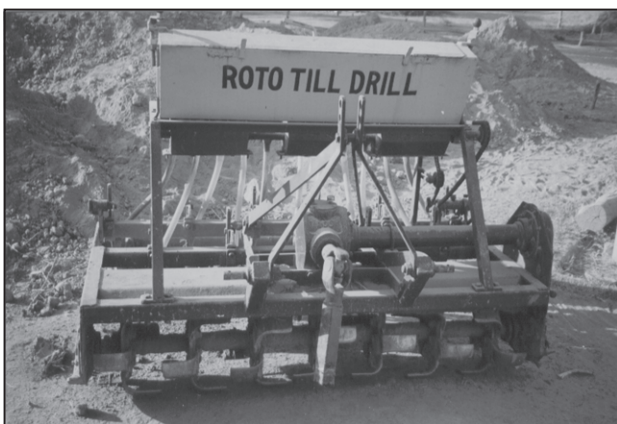
Fig. 5.12 : Roto Till Drill—A modern agricultural equipment