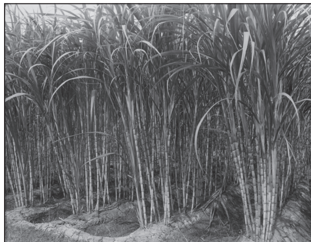
Fig. 5.8 : Sugarcane Cultivation

Sugarcane is a crop of tropical areas. Under rainfed conditions, it is cultivated in sub-humid and humid climates. But it is largely an irrigated crop in India. In Indo-Gangetic plain, its cultivation is largely concentrated in Uttar Pradesh. Sugarcane growing area in western India is spread over Maharashtra and Gujarat.