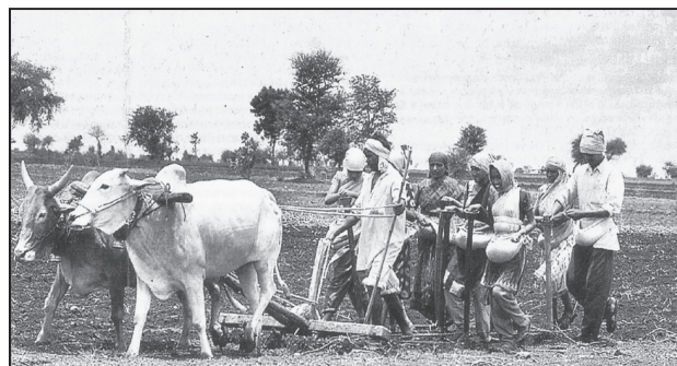
Fig. 5.5 : Farmers sowing soyabean seeds in Amravati, Maharashtra

Soyabean and sunflower are other important oilseeds grown in India. Soyabean is mostly grown in Madhya Pradesh and Maharashtra.