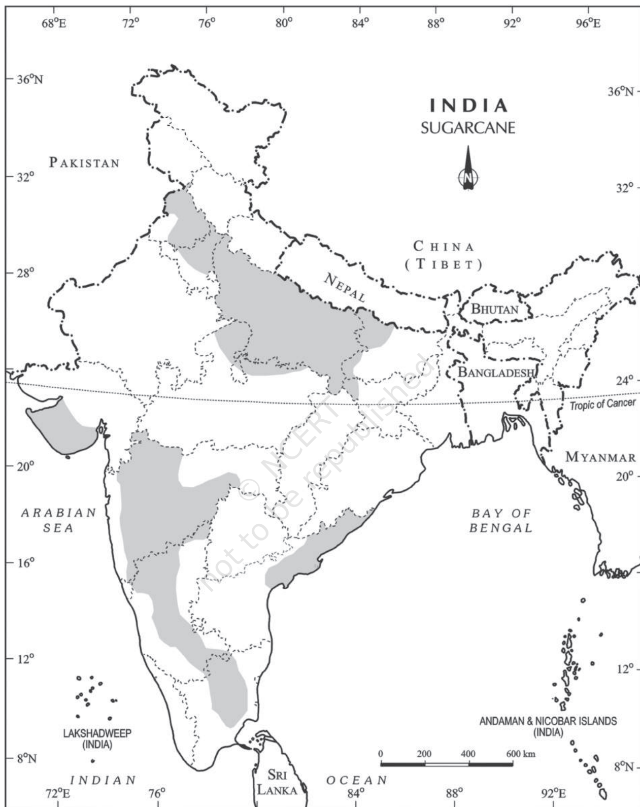
Fig. 5.9 : India – Distribution of Sugarcane