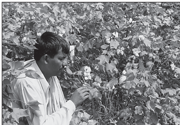
Fig. 5.7 : Cotton Cultivation

Cotton is a tropical crop grown in kharif season in semi-arid areas of the country. India lost a large proportion of cotton growing area to Pakistan during partition. However, its acreage has increased considerably during the last 50 years. India grows both short staple (Indian) cotton as well as long staple (American) cotton called ' narma ' in north-western parts of the country. Cotton requires clear sky during flowering stage.