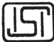
Mark of Bureau of Indian Standards