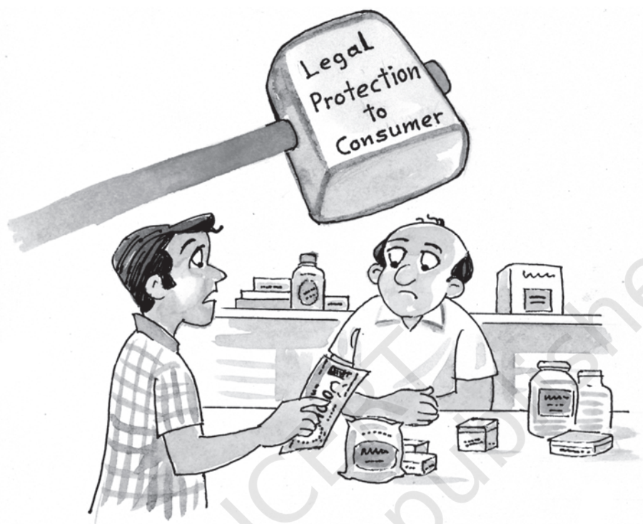
Protection against malpractices and exploitation

1986 seeks to protect and promote the interests of consumers. The Act provides safeguards to consumers against defective goods, deficient services, unfair trade practices, and other forms of their exploitation. The Act provides for the setting up of a three-tier machinery, consisting of District Forums, State Commissions and the National Commission. It also provides for the formation of consumer protection councils in every District and State, and at the apex level.