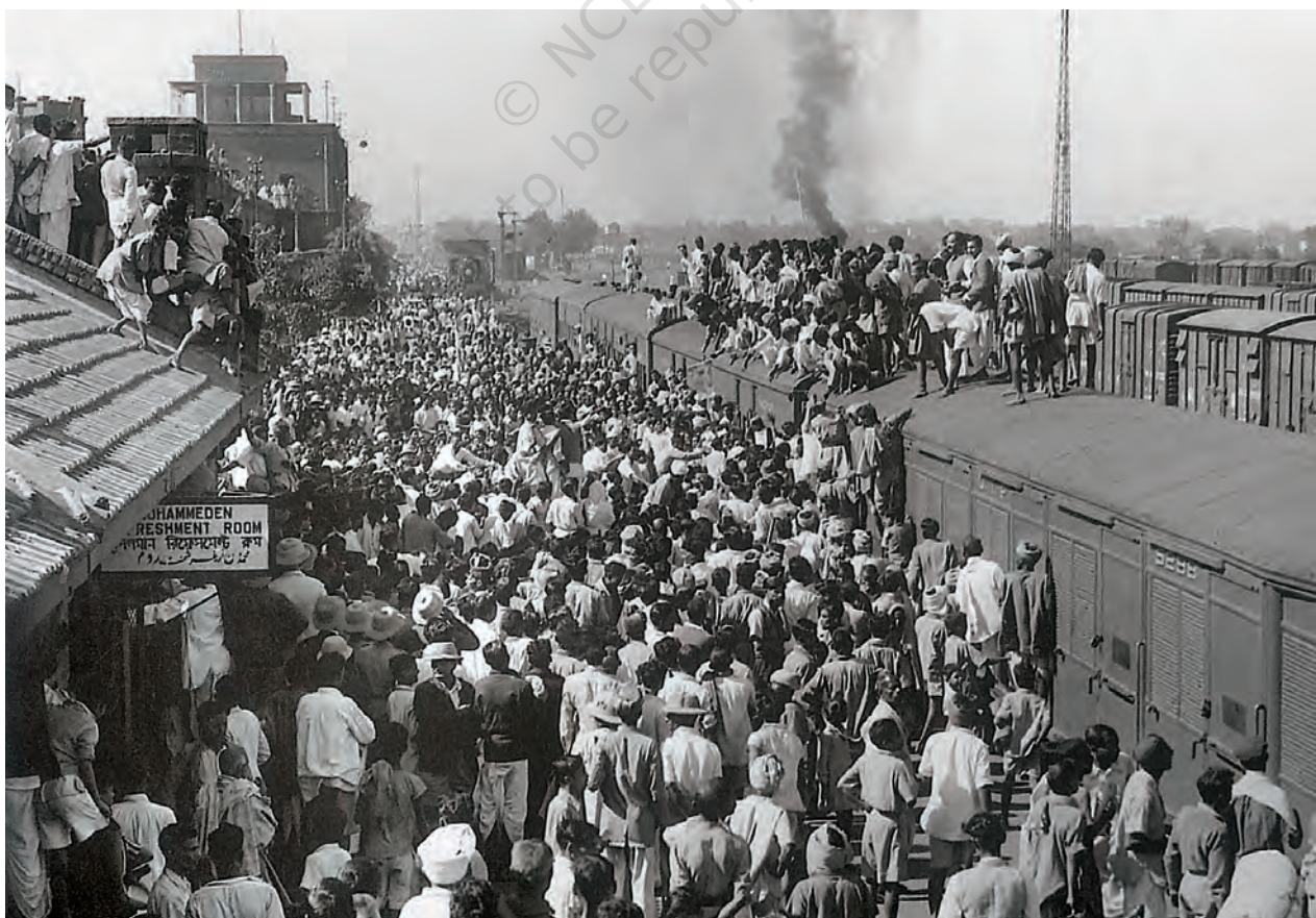
Fig. 14.10 Villagers of Noakhali hope for a glimpse of Mahatma Gandhi

Amidst all this turmoil, one man's valiant efforts at restoring communal harmony bore fruit. The 77-year-old Gandhiji decided to stake his all in a bid to vindicate his lifelong principle of non-violence, and his conviction that people's hearts could be changed. He moved from the villages of Noakhali in East Bengal (present-day Bangladesh) to the villages of Bihar and then to the riot-torn slums of Calcutta and Delhi, in a heroic effort to stop Hindus and Muslims kill each other, careful everywhere to reassure the minority community. In October 1946, Muslims in East Bengal targeted Hindus. Gandhiji visited the area, toured the villages on foot, and persuaded the local Muslims to guarantee the safety of Hindus. Similarly, in other places such as Delhi he tried to build a spirit of mutual trust and