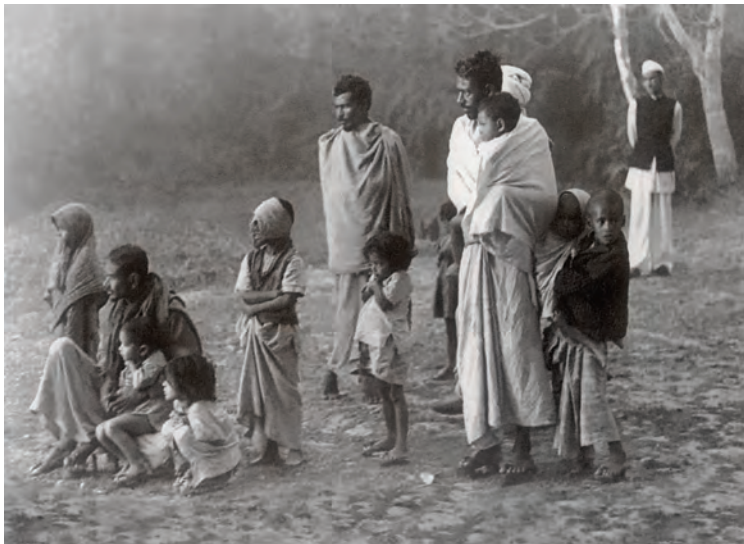
Fig. 14.11 Villagers of a riot-torn village awaiting the arrival of Mahatma Gandhi