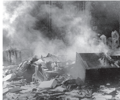
Fig. 14.2 Photographs give us a glimpse of the violence of that time.

also discuss how the history of these experiences can be reconstructed by talking to people and interviewing them, that is, through the use of oral history. At the same time, it will point out the strengths and limitations of oral history. Interviews can tell us about certain aspects of a society's past of which we may know very little or nothing from other types of sources. But they may not reveal very much about many matters whose history we would then need to build from other materials. We will return to this issue towards the end of the chapter.