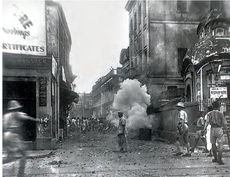
Fig. 14.9 Through those blood-soaked months of 1946, violence and arson spread, killing thousands.