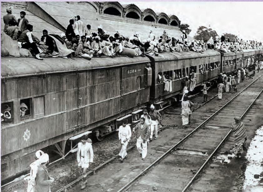
Fig. 14.3 Over 10 million people were uprooted from their homelands and forced to migrate.

“That ‘Stop!’ sounded like a brute order to me and I instantly thought now I’ll be gone. This Sikh will finish me off. But there was no escaping the situation, so I stopped. The burly Sikh came running to me and gave me a mighty hug. Eyes moist, he said, ‘For quite a few years now, I have not met a Punjabi Musalman . I have been longing to meet one but you cannot find Punjabi-speaking Musalman s here.’”