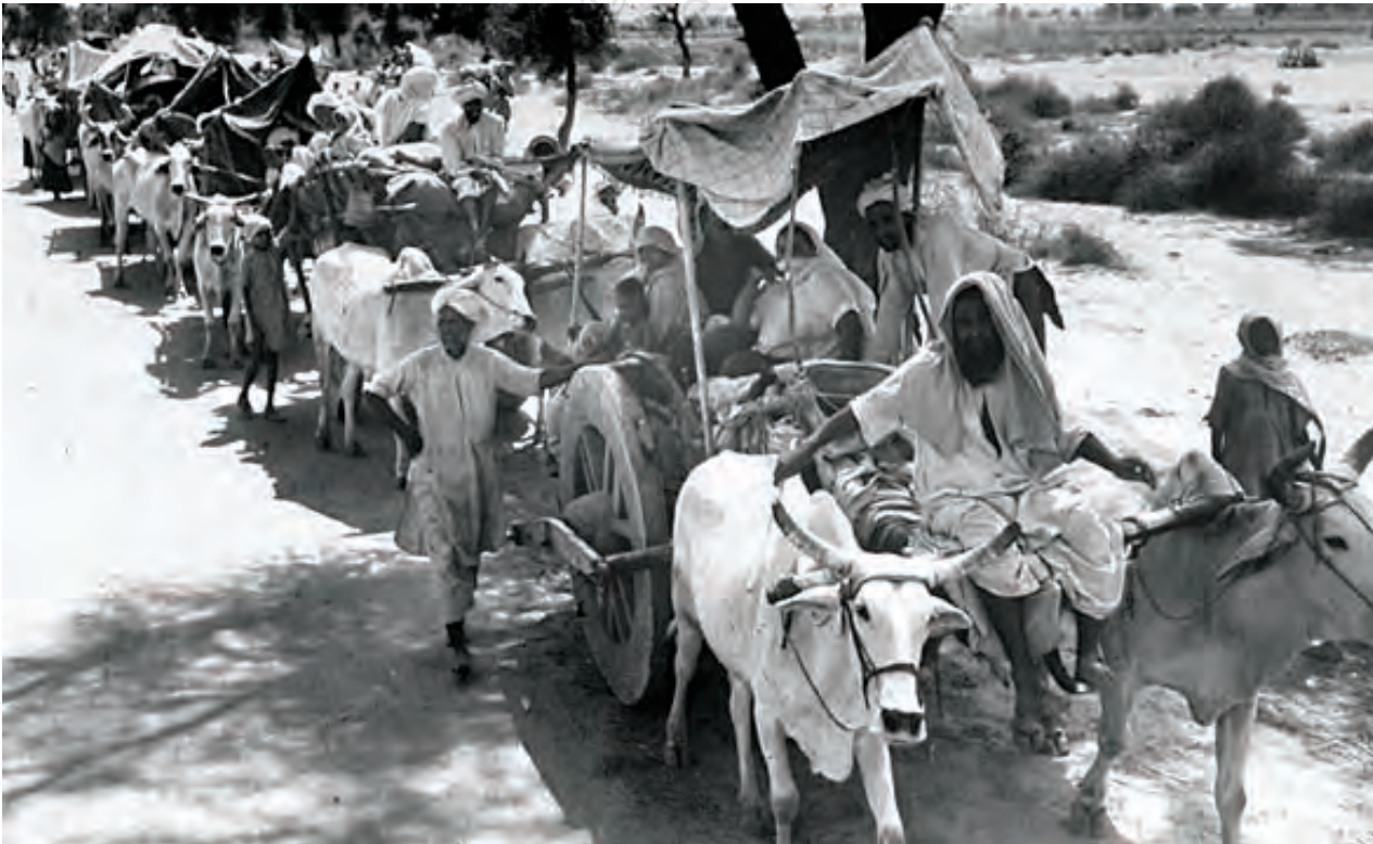
Fig. 14.4 On carts with families and belongings, 1947

The narratives just presented point to the pervasive violence that characterised Partition. Several hundred thousand people were killed and innumerable women raped and abducted. Millions were uprooted, transformed into refugees in alien lands. It is impossible to arrive at any accurate estimate of casualties: informed and scholarly guesses vary from 200,000 to 500,000 people. In all probability, some 15 million had to move across hastily constructed frontiers separating India and Pakistan. As they stumbled across these “shadow lines” – the boundaries between the two new states were not officially known until two days after formal independence – they were rendered homeless, having suddenly lost all their immovable property and most of their movable assets, separated from many of their relatives and friends as well, torn asunder from their moorings, from their houses, fields and fortunes, from their childhood memories. Thus stripped of their local or regional cultures, they were forced to begin picking up their life from scratch.