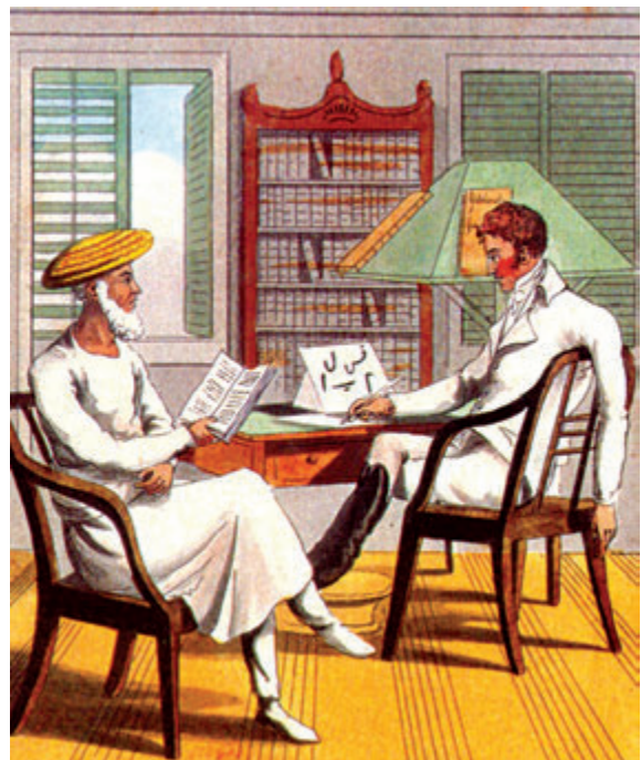
Fig. 1 – William Jones learning Persian

In 1783, a person named William Jones arrived in Calcutta. He had an appointment as a junior judge at the Supreme Court that the Company had set up. In addition to being an expert in law, Jones was a linguist . He had studied Greek and Latin at Oxford, knew French and English, had picked up Arabic from a friend, and had also learnt Persian. At Calcutta, he began spending many hours a day with pandits who taught him the subtleties of Sanskrit language, grammar and