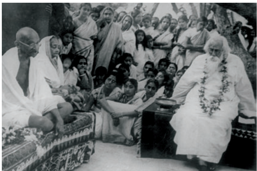
Fig. 10 – Mahatma Gandhi along with Kasturba Gandhi sitting with Rabindranath Tagore and a group of girls at Santiniketan, 1940

Western education, Mahatma Gandhi said, focused on reading and writing rather than oral knowledge; it valued textbooks rather than lived experience and practical knowledge. He argued that education ought to develop a person’s mind and soul. Literacy – or simply learning to read and write – by itself did not count as education. People had to work with their hands, learn a craft, and know how different things operated. This would develop their mind and their capacity to understand.