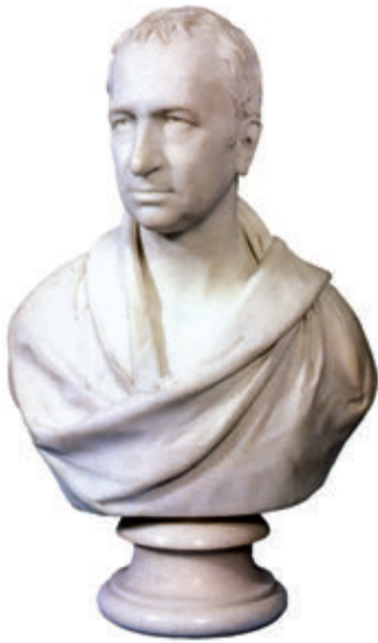
Fig. 2 – Henry Thomas Colebrooke

He was a scholar of Sanskrit and ancient sacred writings of Hinduism.