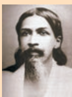
Fig. 9 – Sri Aurobindo Ghose

In a speech delivered on January 15, 1908 in Bombay, Aurobindo Ghose stated that the goal of national education was to awaken the spirit of nationality among the students. This required a contemplation of the heroic deeds of our ancestors. The education should be imparted in the vernacular so as to reach the largest number of people. Aurobindo Ghose emphasised that although the students should remain connected to their own roots, they should also take the fullest advantage of modern scientific discoveries and Western experiments in popular governments. Moreover, the students should also learn some useful crafts so that they could be able to find some moderately remunerative employment after leaving their schools.