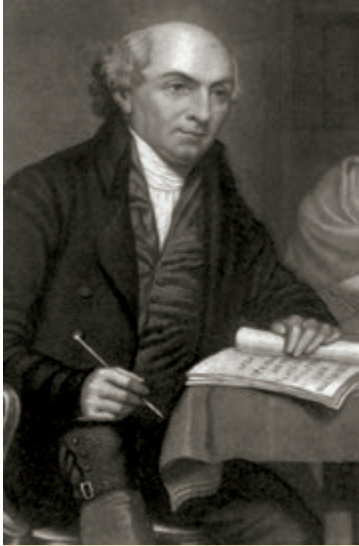
Fig. 6 – William Carey was a Scottish missionary who helped establish the Serampore Mission

The argument for practical education was strongly criticised by the Christian missionaries in India in the nineteenth century. The missionaries felt that education should attempt to improve the moral character of the people, and morality could be improved only through Christian education.