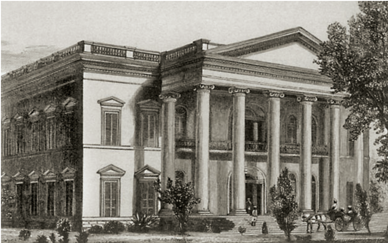
Fig. 7 – Serampore College on the banks of the river Hooghly near Calcutta

Over the nineteenth century, missionary schools were set up all over India. After 1857, however, the British government in India was reluctant to directly support missionary education. There was a feeling that any strong attack on local customs, practices, beliefs and religious ideas might enrage “native” opinion.