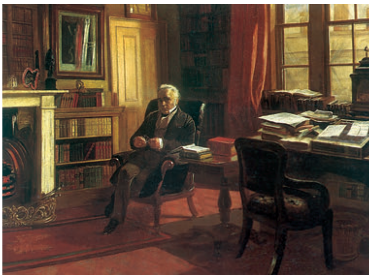
Fig. 4 – Thomas Babington Macaulay in his study