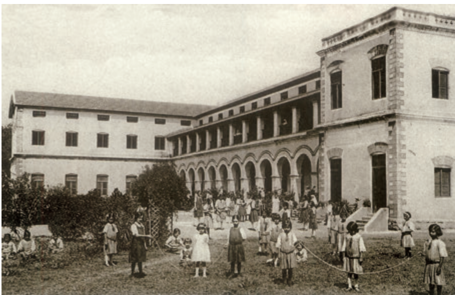
Fig. 12 – Children playing in a missionary school in Coimbatore, early twentieth century

Many individuals and thinkers were thus thinking about the way a national educational system could be fashioned. Some wanted changes within the system set up by the British, and felt that the system could be extended so as to include wider sections of people. Others urged that alternative systems be created so that people were educated into a culture that was truly national. Who was to define what was truly national? The debate about what this “national education” ought to be continued till after independence.