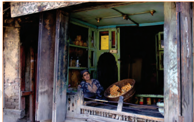
Can you tell what is shown in this picture? Every lane in Kashmir has a bakery. Kashmiri people don't cook roties in their homes, they buy it from such bakeries.

After a long journey Loner and I were about to reach Mumbai. My heart felt heavy. I also felt that my motorcycle did not want to come back. I was happy that I had learnt and experienced so many new things. I had also brought back some memories in my camera. And of course, this was not the end! Next time when Loner and I get bored of the city, we will again set out for a new journey!