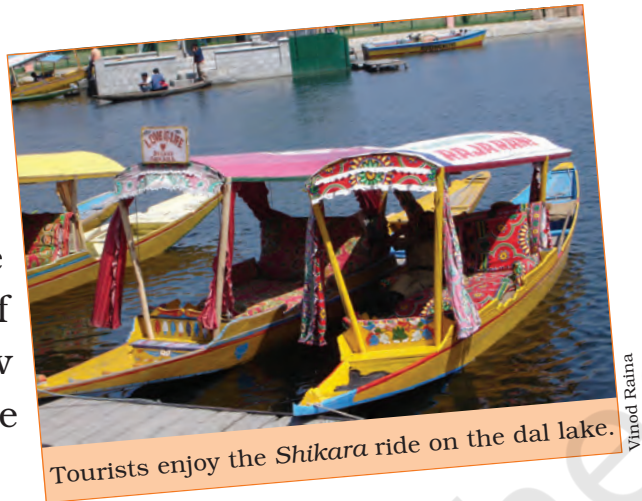
Tourists enjoy the Shikara ride on the dal lake.

When I started my journey, I had not imagined that in one state I would see so many different kinds of houses and lifestyles. I had a wonderful experience of living on the mountains in Leh and another of living on water in Srinagar. I saw how both the houses in these areas were made to suit the climate.