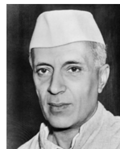
JAWAHARLAL NEHRU (First Prime Minister of India)

The leader of the majority party in Lok Sabha is appointed by the President as the Prime Minister. The other ministers are appointed by the President on the advice of the Prime Minister. If no