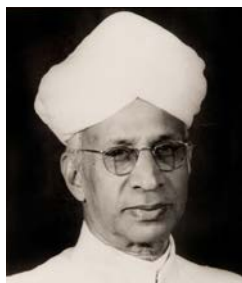
DR. RADHA KRISHNAN (First Vice President of India)

lines of the American Vice-President. Article 63 of the constitution provides for a Vice President of India. This office has been created to maintain the political continuity of the state.