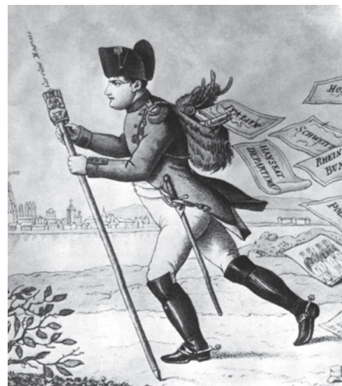
Fig. 5 — The courier of Rhineland loses all that he has on his way home from Leipzig.

However, in the areas conquered, the reactions of the local populations to French rule were mixed. Initially, in many places such as Holland and Switzerland, as well as in certain cities like Brussels, Mainz, Milan and Warsaw, the French armies were welcomed as harbingers of liberty. But the initial enthusiasm soon turned to hostility, as it became clear that the new administrative arrangements did not go hand in hand with political freedom. Increased taxation, censorship, forced conscription into the French armies required to conquer the rest of Europe, all seemed to outweigh the advantages of the administrative changes.