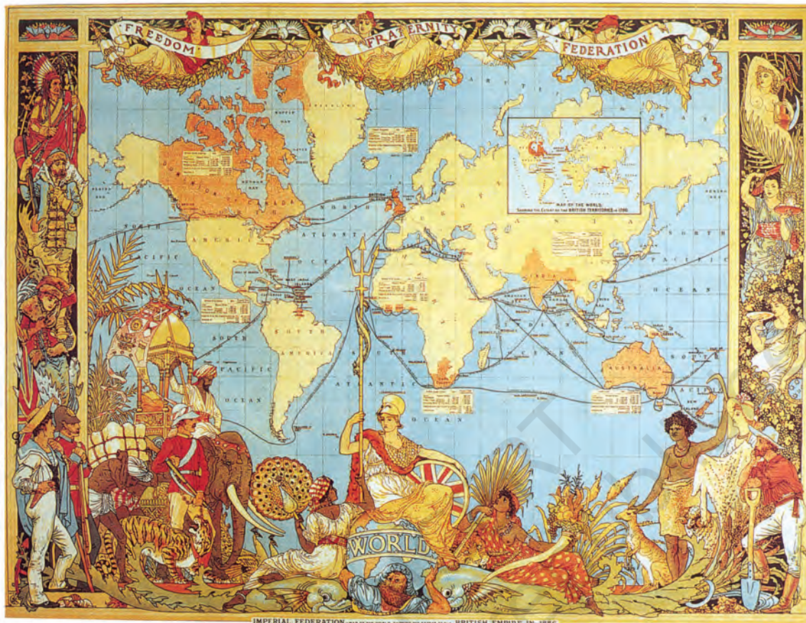
Fig. 20 — A map celebrating the British Empire.

At the top, angels are shown carrying the banner of freedom. In the foreground, Britannia — the symbol of the British nation — is triumphantly sitting over the globe. The colonies are represented through images of tigers, elephants, forests and primitive people. The domination of the world is shown as the basis of Britain's national pride.