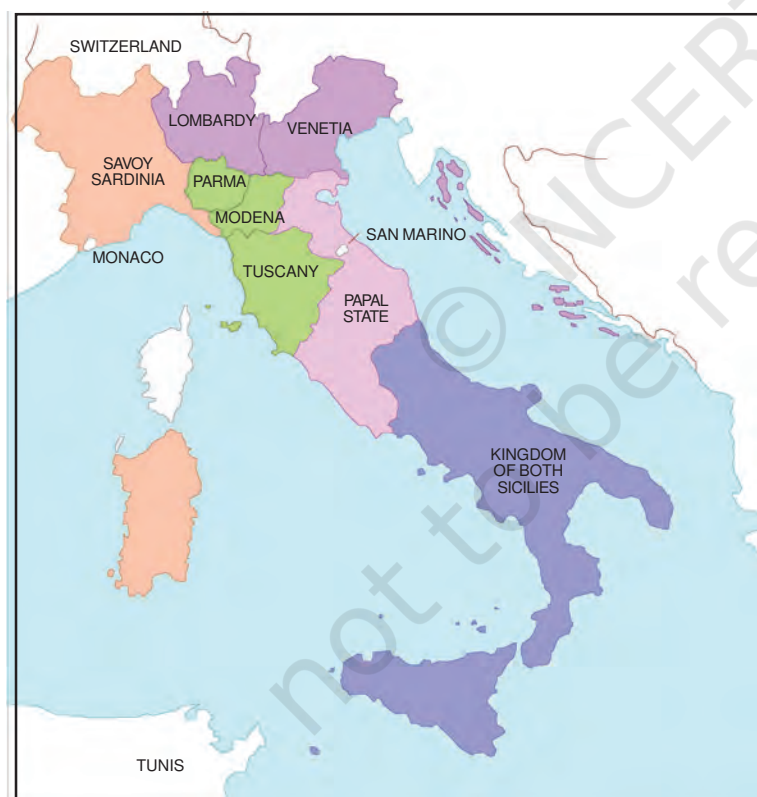
Fig. 14(a) — Italian states before unification, 1858.

Examine Fig. 14(b). Which was the first region to become a part of unified Italy? Which was the last region to join? In which year did the largest number of states join?