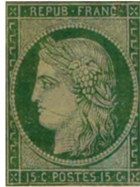
Fig. 16 — Postage stamps of 1850 with the figure of Marianne representing the Republic of France.

Allegory – When an abstract idea (for instance, greed, envy, freedom, liberty) is expressed through a person or a thing. An allegorical story has two meanings, one literal and one symbolic