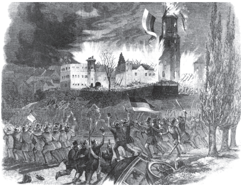
Fig. 9 — Peasants' uprising, 1848.

National Assembly proclaimed a Republic, granted suffrage to all adult males above 21, and guaranteed the right to work. National workshops to provide employment were set up.