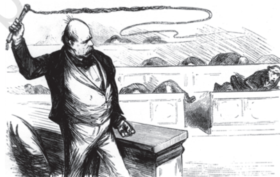
Fig. 13 — Caricature of Otto von Bismarck in the German reichstag (parliament), from Figaro, Vienna, 5 March 1870.

During the 1830s, Giuseppe Mazzini had sought to put together a coherent programme for a unitary Italian Republic. He had also formed a secret society called Young Italy for the dissemination of his goals. The failure of revolutionary uprisings both in 1831 and 1848 meant that the mantle now fell on Sardinia-Piedmont under its ruler King Victor Emmanuel II to unify the Italian states through war. In the eyes of the ruling elites of this region, a unified Italy offered them the possibility of economic development and political dominance.