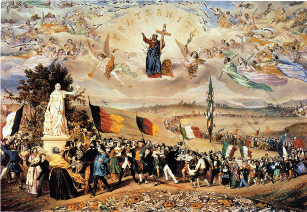
Fig. 1 — The Dream of Worldwide Democratic and Social Republics – The Pact Between Nations, a print prepared by Frédéric Sorrieu, 1848.

In 1848, Frédéric Sorrieu, a French artist, prepared a series of four prints visualising his dream of a world made up of ‘democratic and social Republics’, as he called them. The first print (Fig. 1) of the series, shows the peoples of Europe and America – men and women of all ages and social classes – marching in a long train, and offering homage to the statue of Liberty as they pass by it. As you would recall, artists of the time of the French Revolution personified Liberty as a female figure – here you can recognise the torch of Enlightenment she bears in one hand and the Charter of the Rights of Man in the other. On the earth in the foreground of the image lie the shattered remains of the symbols of absolutist institutions. In Sorrieu’s utopian vision, the peoples of the world are grouped as distinct nations, identified through their flags and national costume. Leading the procession, way past the statue of Liberty, are the United States and Switzerland, which by this time were already nation-states. France,