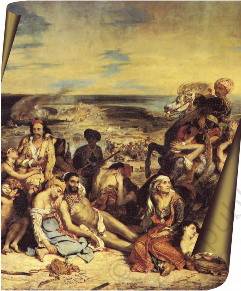
Fig. 8 — The Massacre at Chios, Eugene Delacroix, 1824.

The French painter Delacroix was one of the most important French Romantic painters. This huge painting (4.19m x 3.54m) depicts an incident in which 20,000 Greeks were said to have been killed by Turks on the island of Chios. By dramatising the incident, focusing on the suffering of women and children, and using vivid colours, Delacroix sought to appeal to the emotions of the spectators, and create sympathy for the Greeks.