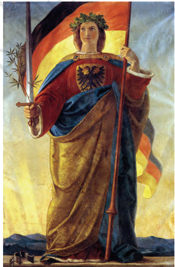
Fig. 17 — Germania, Philip Veit, 1848. The artist prepared this painting of Germania on a cotton banner, as it was meant to hang from the ceiling of the Church of St Paul where the Frankfurt parliament was convened in March 1848.