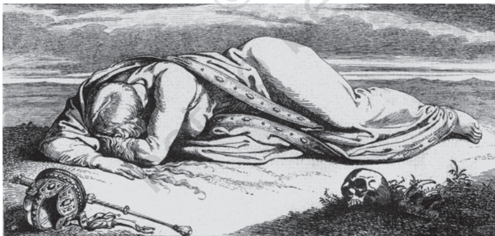
Fig. 18 — The fallen Germania, Julius Hübner, 1850.

Describe what you see in Fig. 17. What historical events could Hübner be referring to in this allegorical vision of the nation?