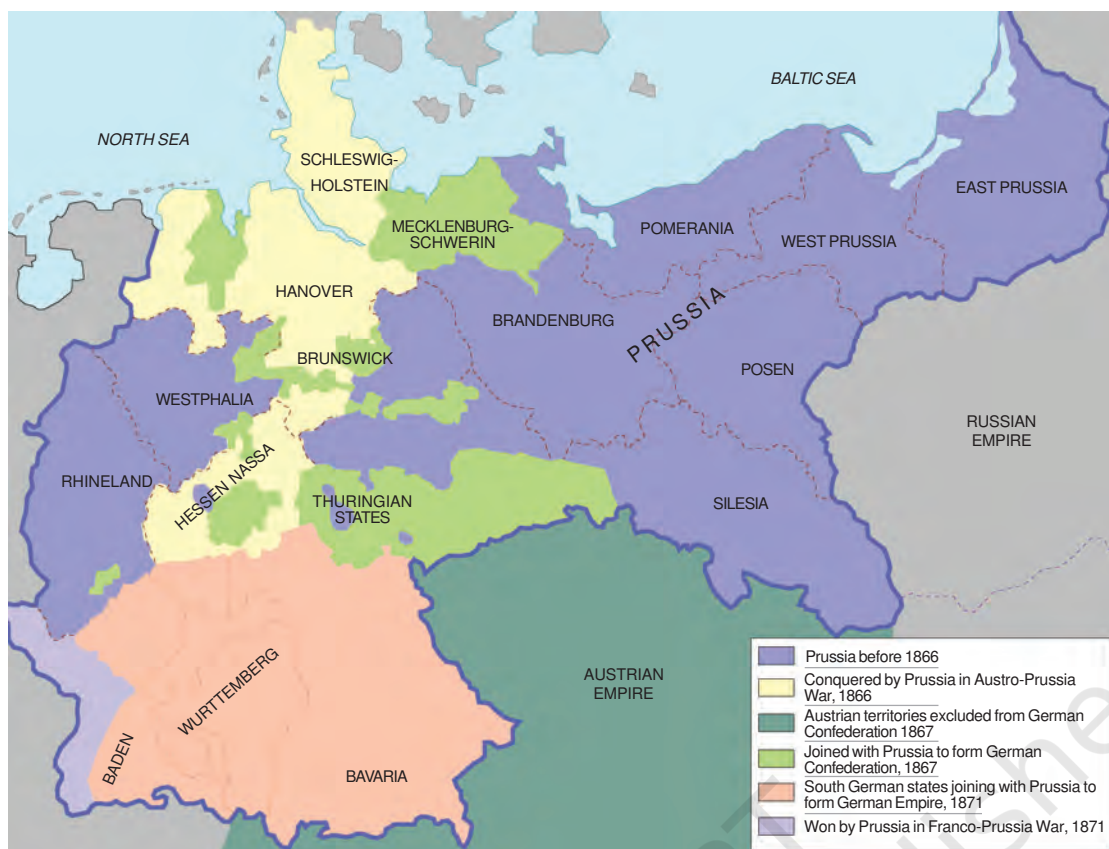
Fig. 12 — Unification of Germany (1866-71).