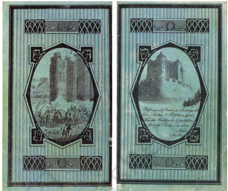
Fig. 2 — The cover of a German almanac designed by the journalist Andreas Rebmann in 1798.

When the news of the events in France reached the different cities of Europe, students and other members of educated middle classes began setting up Jacobin clubs. Their activities and campaigns prepared the way for the French armies which moved into Holland, Belgium, Switzerland and much of Italy in the 1790s. With the outbreak of the revolutionary wars, the French armies began to carry the idea of nationalism abroad.