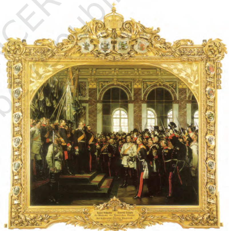
Fig. 11 – The proclamation of the German empire in the Hall of Mirrors at Versailles, Anton von Werner. At the centre stands the Kaiser and the chief commander of the Prussian army, General von Roon. Near them is Bismarck. This monumental work (2.7m x 2.7m) was completed and presented by the artist to Bismarck on the latter's 70th birthday in 1885.

The nation-building process in Germany had demonstrated the dominance of Prussian state power. The new state placed a strong emphasis on modernising the currency, banking, legal and judicial systems in Germany. Prussian measures and practices often became a model for the rest of Germany.