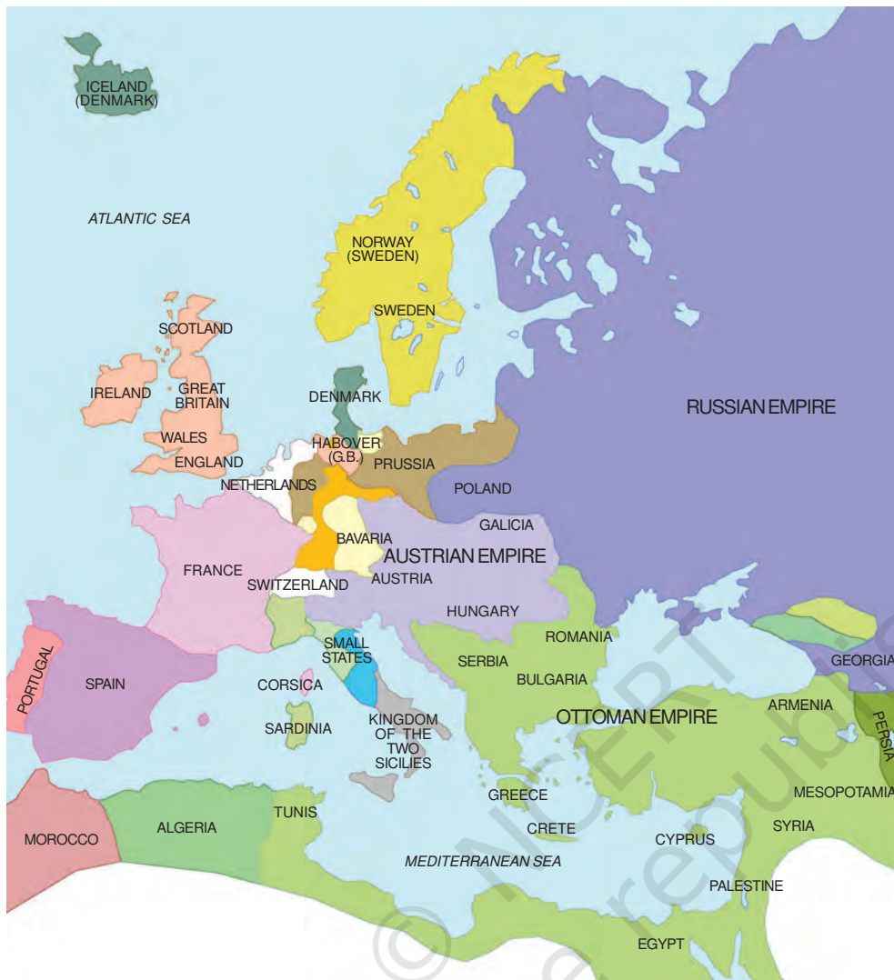
Fig. 3 — Europe after the Congress of Vienna, 1815.

Within the wide swathe of territory that came under his control, Napoleon set about introducing many of the reforms that he had already introduced in France. Through a return to monarchy Napoleon had, no doubt, destroyed democracy in France, but in the administrative field he had incorporated revolutionary principles in order to make the whole system more rational and efficient. The Civil Code of 1804 – usually known as the Napoleonic Code – did away with all privileges based on birth, established equality before the law and secured the right to property. This Code was exported to the regions under French control. In the Dutch Republic, in Switzerland, in Italy and Germany, Napoleon simplified administrative divisions, abolished the feudal system and freed peasants from serfdom and manorial dues. In the towns too, guild restrictions were removed. Transport and communication systems were improved. Peasants, artisans, workers and new businessmen