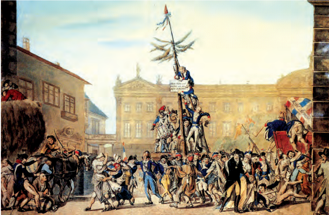
Fig. 4 — The Planting of Tree of Liberty in Zweibrücken, Germany.

The subject of this colour print by the German painter Karl Kaspar Fritz is the occupation of the town of Zweibrücken by the French armies. French soldiers, recognisable by their blue, white and red uniforms, have been portrayed as oppressors as they seize a peasant's cart (left), harass some young women (centre foreground) and force a peasant down to his knees. The plaque being affixed to the Tree of Liberty carries a German inscription which in translation reads: 'Take freedom and equality from us, the model of humanity.' This is a sarcastic reference to the claim of the French as being liberators who opposed monarchy in the territories they entered.