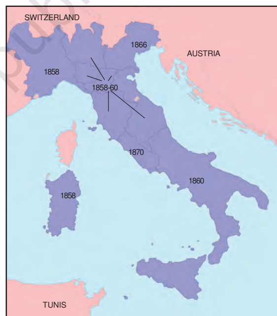
Fig. 14(b) — Italy after unification. The map shows the year in which different regions (seen in Fig 14(a)) become part of a unified Italy.