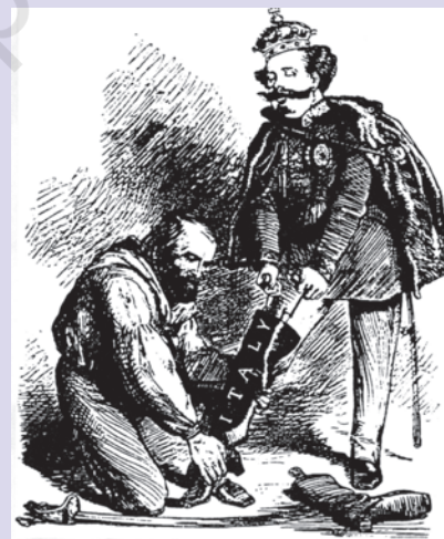
Fig. 15 – Garibaldi helping King Victor Emmanuel II of Sardinia-Piedmont to pull on the boot named ‘Italy’. English caricature of 1859.

In 1867, Garibaldi led an army of volunteers to Rome to fight the last obstacle to the unification of Italy, the Papal States where a French garrison was stationed. The Red Shirts proved to be no match for the combined French and Papal troops. It was only in 1870 when, during the war with Prussia, France withdrew its troops from Rome that the Papal States were finally joined to Italy.