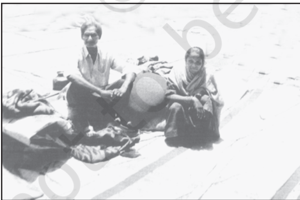
A homeless couple

The facts of contemporary history are also facts about the success and the failure of individual men and women. When a society is industrialised, a peasant becomes a worker; a feudal lord is liquidated or becomes a businessman. When classes rise or fall, a man is employed or unemployed; when the rate of investment goes up or down, a man takes new heart or goes broke. When wars happen, an insurance salesman becomes a rocket launcher; a store clerk, a radar man; a wife lives alone; a child grows up without a father. Neither the life of an individual nor the history of a society can be understood without understanding both... (Mills 1959).