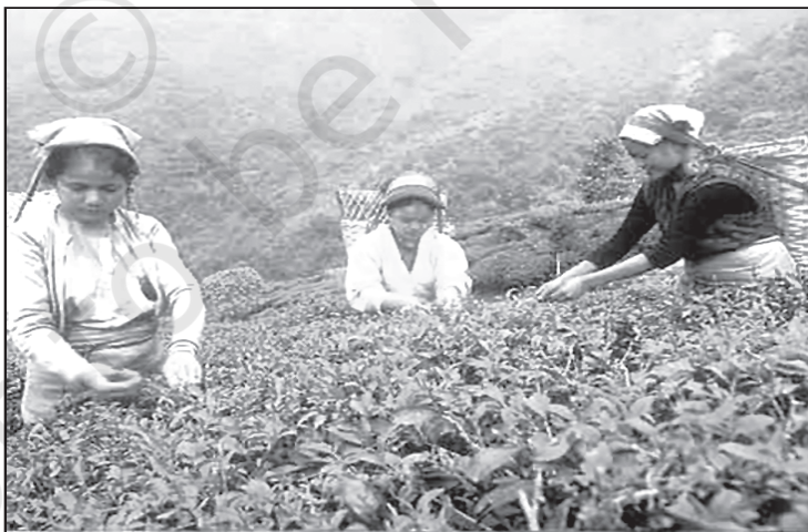
Tea pickers in Assam

Other changes have also redefined the nature of sociology and social anthropology. Modernity as we saw led to a process whereby the smallest village was impacted by global processes. The most obvious example is colonialism. The most remote village of India under British colonialism saw its land laws and administration change, its revenue extraction alter, its manufacturing industries collapse.