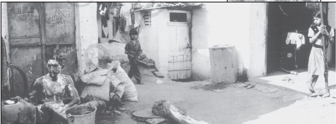
From working class neighbourhoods to slum localities