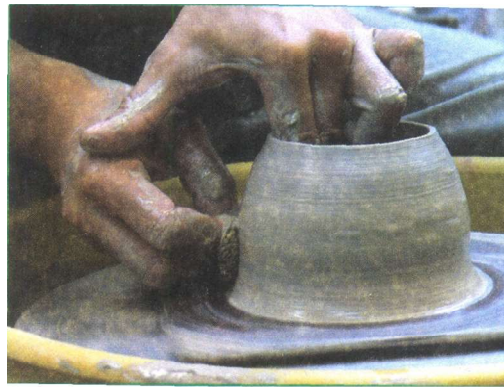
Figure : Earthen pot made of clay

It consists mostly of clay particles, the sand particles being far less in proportion. Clayey soil is very sticky and so tilling is difficult. It is usually used for making pots and toys.