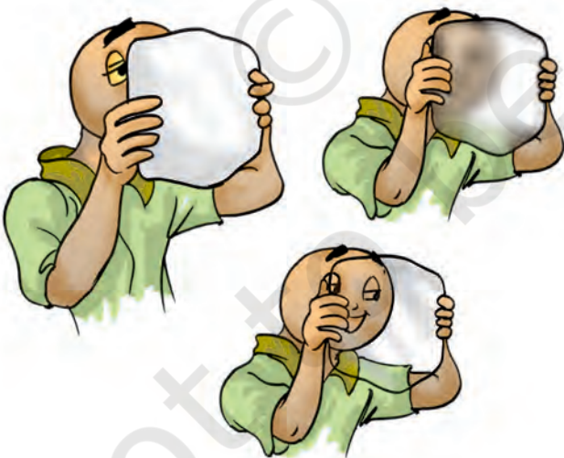
Fig. 4.7 Looking through opaque, transparent or translucent material

You might have played the game of hide and seek. Think of some places where you would like to hide so that you are not seen by others. Why did you choose those places? Would you have tried to