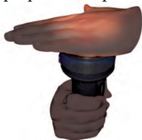
Fig. 4.9 Does torch light pass through your palm?

We can therefore group materials as opaque, transparent and translucent.