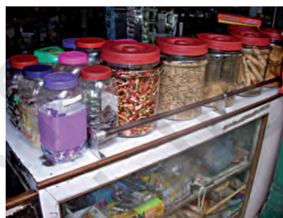
Fig. 4.8 Transparent bottles in a shop

hide behind a glass window? Obviously not, as your friends can see through that and spot you. Can you see through all the materials? Those substances or materials, through which things can be seen, are called transparent (Fig. 4.7). Glass, water, air and some plastics are examples of transparent materials. Shopkeepers usually prefer to keep biscuits, sweets and other eatables in transparent containers of glass or