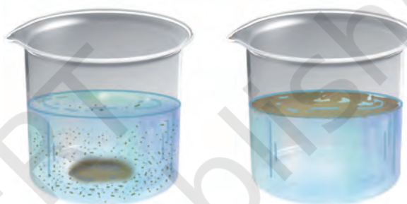
Fig. 4.4 What disappears, what doesn't?

beakers. Fill each one of them about two-thirds with water. Add a small amount (spoonful) of sugar to the first glass, salt to the second and similarly, add small amounts of the other substances into the other glasses. Stir the contents of each of them with a spoon. Wait for a few minutes. Observe what happens to the substances added to water (Fig. 4.4). Note your observations as shown in Table 4.3.