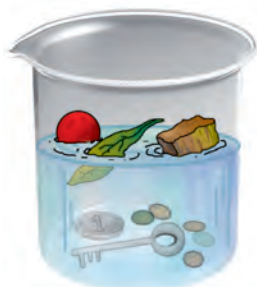
Figure 4.6 Some objects float in water while others sink in it

drops of honey that you let fall into a glass of water. What happens to all of these?