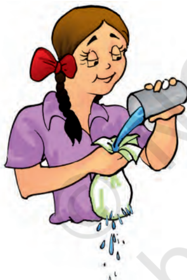
Fig. 4.2 Using a cloth tumbler

Have you ever wondered why a tumbler is not made with a piece of cloth? Recall our experiments with pieces of cloth in Chapter 3 and also keep in mind that we generally use a tumbler to keep a liquid. Therefore, would it not be silly, if we were to make a tumbler out of cloth (Fig 4.2)! What we need for a tumbler is glass, plastics, metal or other such material that will hold water. Similarly, it would not be wise to use paper-like materials for cooking vessels.