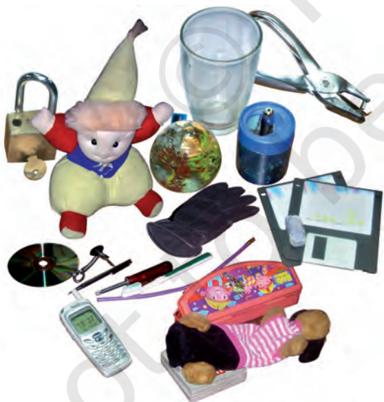
Fig. 4.1 Objects around us

Let us collect as many objects as possible, from around us. Each of us could get some everyday objects from home and we could also collect some objects from the classroom or from outside the school. What will we have in our collection? Chalk, pencil, notebook, rubber, duster, a hammer, nail, soap, spoke of a wheel, bat,