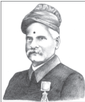
Raja Ravi Varma

Apart from ways of life and thinking the west influenced Indian art and literature. Artists like Ravi Varma, Abanindranath Tagore, Chandu Menon and Bankimchandra Chattopadhyaya were all grappling with the colonial encounter. The box below captures the many ways that style, technique and the very theme of an artist like Ravi Varma were shaped by western and indigenous traditions. It discusses the portrait of a family in a matrilineal community of Kerala but one that significantly resembles the very typical patrilineal nuclear family of the modern west consisting of the father, mother and children.