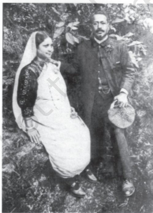
The mix and match of the traditional and modern

of cloth was differently worn in different regions. The standard way that the modern middle class woman wears it was a novel combination of the traditional sari with the western 'petticoat' and 'blouse'.