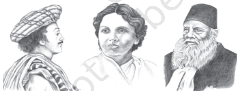
Raja Ram Mohun Roy