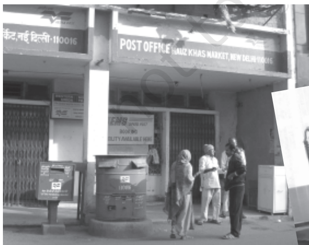
New technologies and organisations that speeded up various forms of communication

New technologies speeded up various forms of communication. The printing press, telegraph, and later the microphone, movement of people and goods through steamship and railways helped quick movement of new ideas. Within India, social reformers from Punjab and Bengal exchanged ideas with reformers from Madras and Maharashtra. Keshav Chandra Sen of Bengal visited Madras in 1864. Pandita Ramabai travelled to different corners of the country. Some of them went to other countries. Christian missionaries reached remote corners of present day Nagaland, Mizoram and Meghalaya.