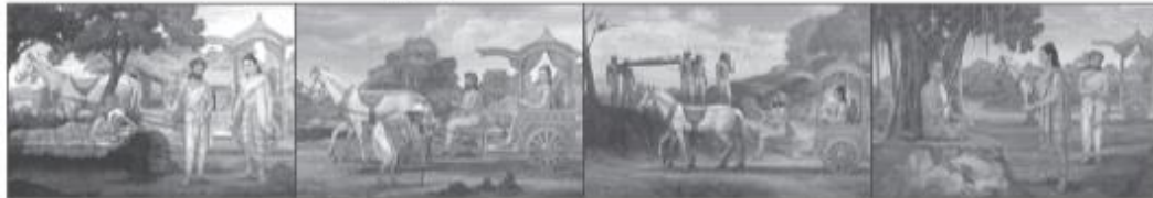
(1) He laughed. (2) He was shocked. (3) He cried. (4) He was angry.