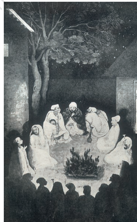
Fig. 5.5 An eighteenth-century painting depicting travellers gathered around a campfire

Compare the objectives of Al-Biruni and Ibn Battuta in writing their accounts.