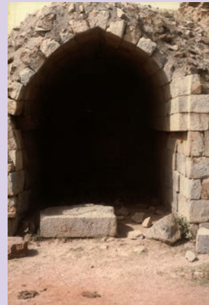
Fig. 5.8 (top) An arch in Tughlakabad, Delhi

The city of Dehli covers a wide area and has a large population ... The rampart round the city is without parallel. The breadth of its wall is eleven cubits; and inside it are houses for the night sentry and gate-keepers. Inside the ramparts, there are store-houses for storing edibles, magazines, ammunition, ballistas and siege machines. The grains that are stored (in these ramparts) can last for a long time, without rotting ... In the interior of the rampart, horsemen as well as infantrymen move from one end of the city to another. The rampart is pierced through by windows which open on the side of the city, and it is through these windows that light enters inside. The lower part of the rampart is built of stone; the upper part of bricks. It has many towers close to one another. There are twenty eight gates of this city which are called darwaza , and of these, the Budaun darwaza is the greatest; inside the Mandwi darwaza there is a grain market; adjacent to the Gul darwaza there is an orchard ... It (the city of Dehli) has a fine cemetery in which graves have domes over them, and those that do not have a dome, have an arch, for sure. In the cemetery they sow flowers such as tuberose, jasmine, wild rose, etc.; and flowers blossom there in all seasons.