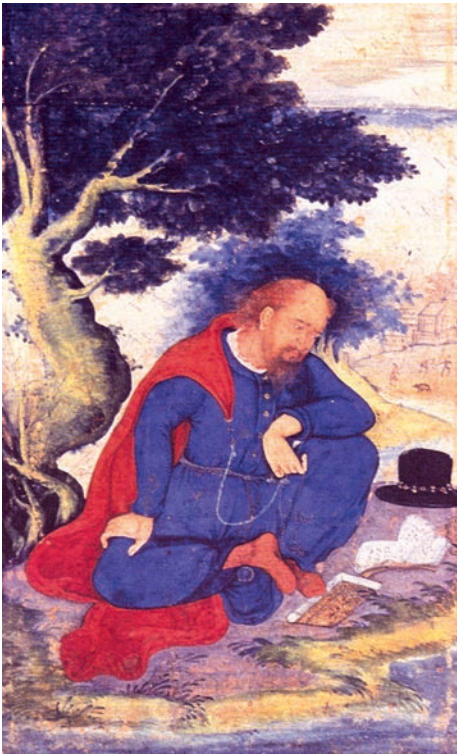
Fig. 5.6 A seventeenth-century painting depicting Bernier in European clothes