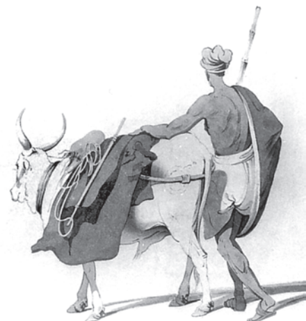
Fig. 5.11 Drawings such as this nineteenth-century example often reinforced the notion of an unchanging rural society.

As an extension of this, Bernier described Indian society as consisting of undifferentiated masses of impoverished people, subjugated by a small minority of a very rich and powerful ruling class. Between the poorest of the poor and the richest of the rich, there was no social group or class worth the name. Bernier confidently asserted: "There is no middle state in India."