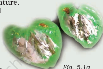
Fig. 5.1a Paan leaves

In this chapter we shall see how our knowledge of the past can be enriched through a consideration of descriptions of social life provided by travellers who visited the subcontinent, focusing on the accounts of three men: Al-Biruni who came from Uzbekistan (eleventh century), Ibn Battuta who came from Morocco, in northwestern Africa (fourteenth century) and the Frenchman François Bernier (seventeenth century).