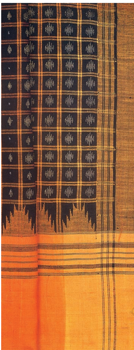
Fig. 5.10 Ikat weaving patterns such as this were adopted and modified at several coastal production centres in the subcontinent and in Southeast Asia.

➤ Why do you think Ibn Battuta highlighted these activities in his description?