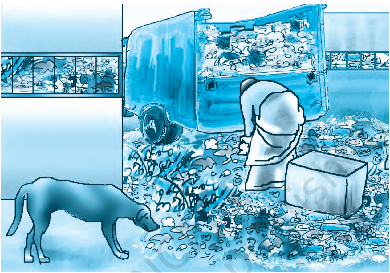
Fig. 10.1: A rag picker segregating materials from garbage dump

However, with the enormous volume of waste that is being generated now-a-days, the concerned authorities are finding it difficult to deal with this problem. Most often we find that all sorts of solid wastes are dumped together in the landfills, which in many places, have already overreached its accumulation level. Moreover, groundwater in the immediate vicinity of such landfill sites is prone to contamination through continuous contact with the deposited waste. (Details of the structure of landfills have already been given in the Science textbook of Class VI).