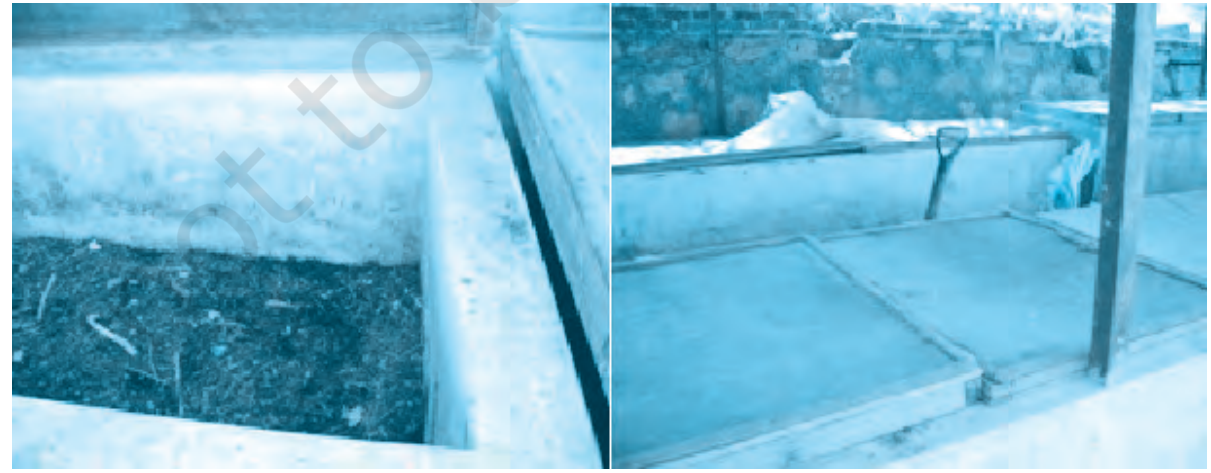
Fig. 10.5 Compost Pit prepared by Bethany Society, Shillong, Meghalaya

Often you may have come across persons (the Kabariwalas ) who visit our home, and to whom we sell old newspapers, magazines, bottles, tins, etc. Maybe, you have never thought where these products go, and what happens to them. These products are utilised as raw materials for manufacturing other products. In other words, these products are recycled . This is actually an important effort, as in this process, we not only reduce the load of garbage, but also conserve natural resources. Some of the common items that can be recycled are