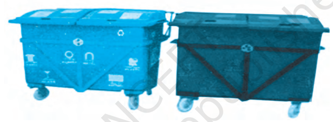
Fig. 10.4: Blue and Green Bins

(a) Wet waste, (b) dry waste, (c) hazardous waste.