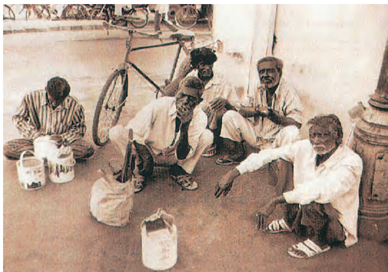
At labour chowk, daily wage workers wait with their tools for people to come and take them for work.

trucks in the market, dig pipelines and telephone cables and also build roads. There are thousands of such casual workers in the city.