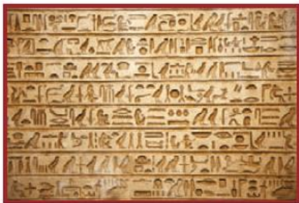
Egyptian Signs and Symbols

The process of sending and receiving messages from one place to another is called communication. Communication means the exchange of thoughts, messages and information between two or more people. In ancient times, people used to communicate with their near and dear ones through signs and symbols. They used to send messages by beating drums and by signalling through smoke and fire. Smoke signals are used by army personnel even today to send messages. Today, communication has become very fast and easy. There are various means of communication.