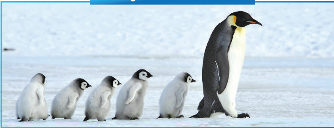
Penguins in Antarctica.

Antarctica is the coldest continent on Earth. It is also called the White Continent or the Frozen Continent . Antarctica experiences half a year of sun light and half a year of complete darkness. Penguins are found in Antarctica. There are only permanent research stations from different countries can be found there.