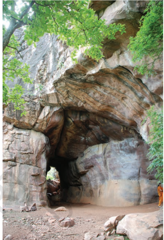
Cave entrance, Bhimbetka, Madhya Pradesh

The paintings of the Upper Palaeolithic phase are linear representations, in green and dark red, of huge animal figures, such as bisons, elephants, tigers, rhinos and boars besides stick-like human figures. A few are wash paintings but mostly they are filled with