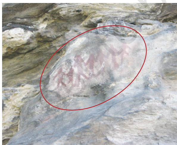
Hand-linked dancing figures, Lakhudiyar, Uttarakhand

Remnants of rock paintings have been found on the walls of the caves situated in several districts of Madhya Pradesh, Uttar Pradesh, Andhra Pradesh, Karnataka and Bihar. Some paintings have been reported from the Kumaon hills in Uttarakhand also. The rock shelters on banks of the River Suyal at Lakhudiyar, about twenty kilometres on the Almora–Barechina road, bear these prehistoric paintings. Lakhudiyar literally means one lakh caves. The paintings here can be divided into three categories: man, animal and geometric patterns in white, black and red ochre. Humans are represented in stick-like forms. A long-snouted animal, a fox and a multiple legged lizard are the main animal motifs. Wavy lines, rectangle-filled geometric designs, and groups of dots can also be seen here. One of the interesting scenes depicted here is of hand-linked dancing human figures. There is some superimposition of paintings. The earliest are in black; over these are red ochre paintings and the last group comprises white paintings. From Kashmir two slabs with engravings have been reported. The granite rocks of Karnataka and Andhra Pradesh provided suitable canvases to the Neolithic man for his paintings. There are several such sites but more famous among them are Kupgallu, Piklihal and Tekkalkota. Three types of paintings have been reported from here—paintings in white, paintings in red ochre over a white background and paintings in red ochre. These