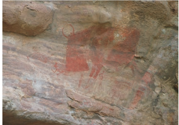
Painting showing a man being hunted by a beast, Bhimbetka

made out of limestone. The rock of mineral was first ground into a powder. This may then have been mixed with water and also with some thick or sticky substance such as animal fat or gum or resin from trees. Brushes were made of plant fibre. What is amazing is that these colours have survived thousands of years of adverse weather conditions. It is believed that the colours have remained intact because of the chemical reaction of the oxide present on the surface of the rocks.