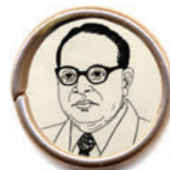
Bhimrao Ramji Ambedkar

(1887-1971) born: Gujarat. Advocate, historian and linguist. Congress leader and Gandhian. Later: Minister in the Union Cabinet. Founder of the Swatantra Party.