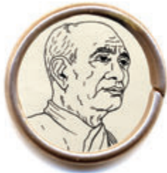
Vallabhbhai Jhaverbhai Patel

(1875-1950) born: Gujarat. Minister of Home, Information and Broadcasting in the Interim Government. Lawyer and leader of Bardoli peasant satyagraha. Played a decisive role in the integration of the Indian princely states. Later: Deputy Prime Minister.