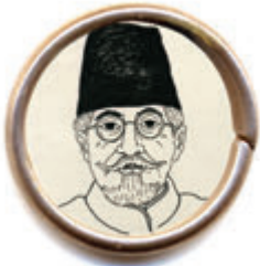
Abul Kalam Azad

(1888-1958) born: Saudi Arabia. Educationist, author and theologian; scholar of Arabic. Congress leader, active in the national movement. Opposed Muslim separatist politics. Later: Education Minister in the first union cabinet.