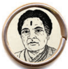
G. Durgabai Deshmukh (1909-1981)

born: Andhra Pradesh. Advocate and public activist for women's emancipation. Founder of Andhra Mahila Sabha. Congress leader. Later: Founder Chairperson of Central Social Welfare Board.