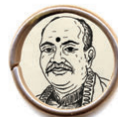
Shyama Prasad Mukherjee

(1891-1956) born: Madhya Pradesh. Chairman of the Drafting Committee. Social revolutionary thinker and agitator against caste divisions and caste based inequalities. Later: Law minister in the first cabinet of post-independence India. Founder of Republican Party of India.