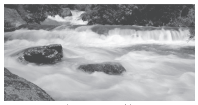
Figure 3.3: Rapids

The Himalayan drainage system has evolved through a long geological history. It mainly includes the Ganga, the Indus and the Brahmaputra river basins. Since these are fed both by melting of snow and precipitation, rivers of this system are perennial. These rivers pass through the giant gorges carved out by the erosional activity carried on simultaneously with the uplift of the Himalayas. Besides deep gorges, these rivers also form V-shaped valleys, rapids and waterfalls in their mountainous