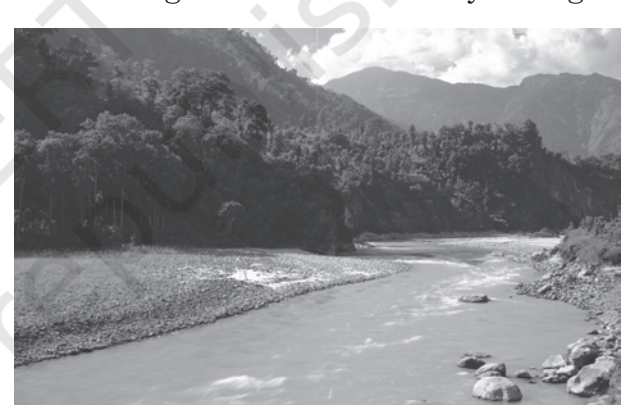
Figure 3.1: A River in the Mountainous Region

2006) in this class. Can you, then, explain the reason for water flowing from one direction to the other? Why do the rivers originating from the Himalayas in the northern India and the Western Ghat in the southern India flow towards the east and discharge their waters in the Bay of Bengal?