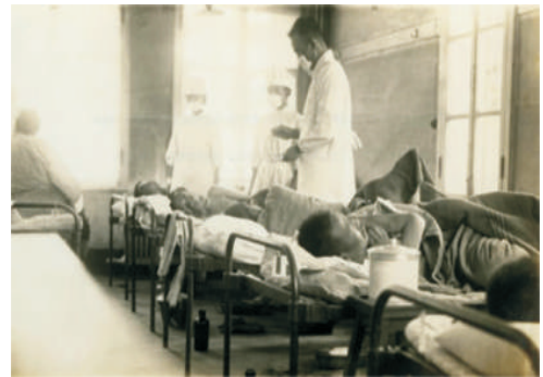
Craiglockhart. October, 1917.

No doubt they'll soon get well; the shock and strain have caused their stammering, disconnected talk. Of course they're 'longing to go out again, '- These boys with old, scared faces, learning to walk. They'll soon forget their haunted nights; their cowed Subjection to the ghosts of friends who died, Their dreams that drip with murder; and they'll be proud Of glorious war that shatter'd all their pride... Men who went out to battle, grim and glad; Children, with eyes that hate you, broken and mad.