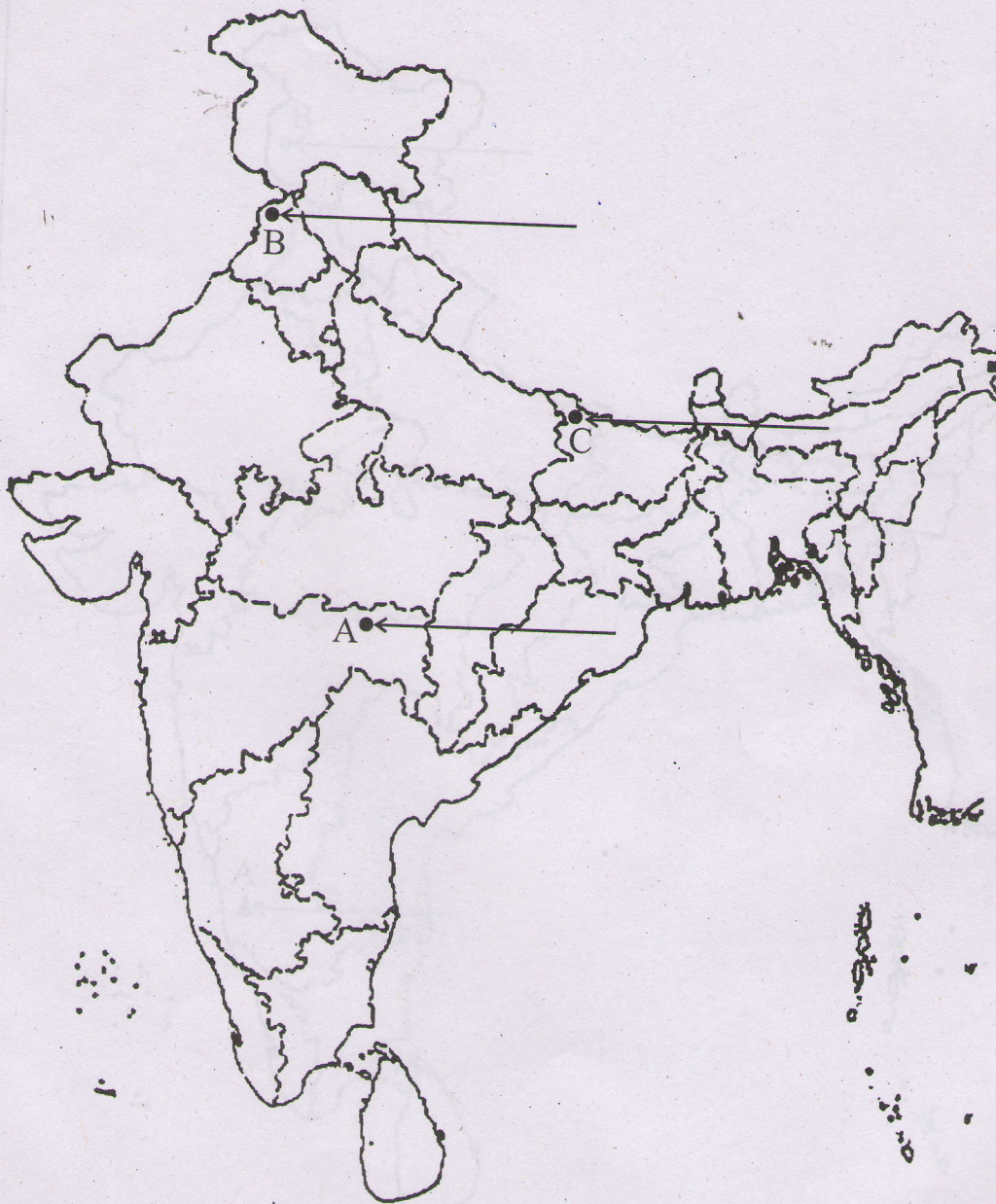
MAP for Q. No. 29