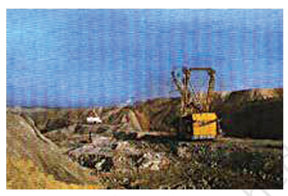
Fig. 5.2: A coal mine

When heated in air, coal burns and produces mainly carbon dioxide gas.